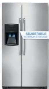
Frigidaire Side-by-Side Refrigerator