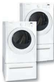
Frigidaire Front-Loading Washer & Dryer