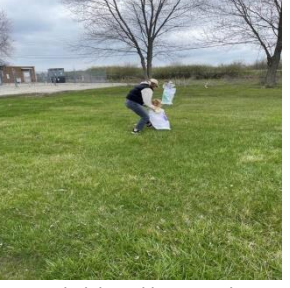
Lynnsey helping with potato bag race.