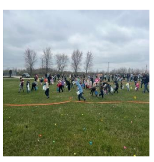
Having fun hunting.