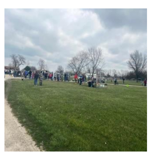
Getting a bunch.