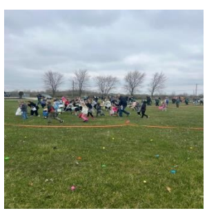
The HUNT begins!