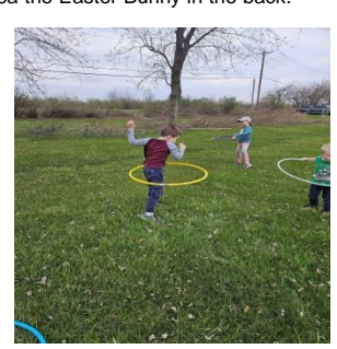
Children in the hula hoop challenge.