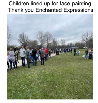
Children lined up waiting their turn for getting those eggs.