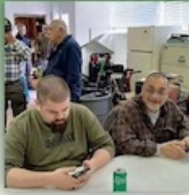
DAV FELLOWSHIP DINNER

LAST WEDNESDAY OF EACH MONTH 5-7PM FRIENDS AND FAMILY WELCOME