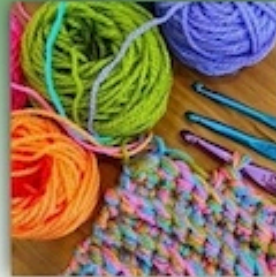
CROCHET & TEA

DAV DEPARTMENT OF NEW MEXICO 2511 UTAH STREET NE ALBUQUERQUE, NM 87110 PLEASE RSVP AT: WWW.DAVNEWMEXICO.ORG (505) 294-6193