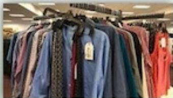
CLOTHING CLOSET FREE CLOTHING FOR VETERANS

DAV DEPARTMENT OF NEW MEXICO 2511 UTAH STREET NE ALBUQUERQUE, NM 87110 PLEASE RSVP AT: WWW.DAVNEWMEXICO.ORG (505) 294-6193