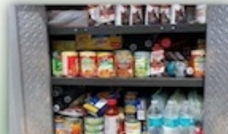
FOOD PANTRY FREE FOOD FOR VETERANS

DAV DEPARTMENT OF NEW MEXICO 2511 UTAH STREET NE ALBUQUERQUE, NM 87110 PLEASE VISIT: WWW.DAVNEWMEXICO.ORG (505) 294-6193