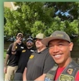
SUPPORT GROUP & SOCIAL HOUR

DAV DEPARTMENT OF NEW MEXICO 2511 UTAH STREET NE ALBUQUERQUE, NM 87110 PLEASE RSVP AT: WWW.DAVNEWMEXICO.ORG (505) 294-6193