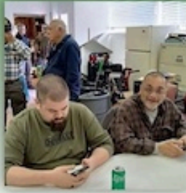
DAV FELLOWSHIP DINNER

LAST WEDNESDAY OF EACH MONTH 5-7PM FRIENDS AND FAMILY WELCOME