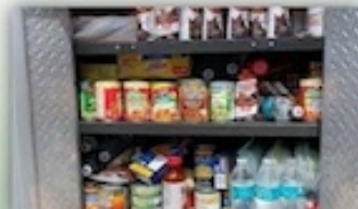
FOOD PANTRY FREE FOOD FOR VETERANS

DAV DEPARTMENT OF NEW MEXICO 2511 UTAH STREET NE ALBUQUERQUE, NM 87110 PLEASE VISIT: WWW.DAVNEWMEXICO.ORG (505) 294-6193