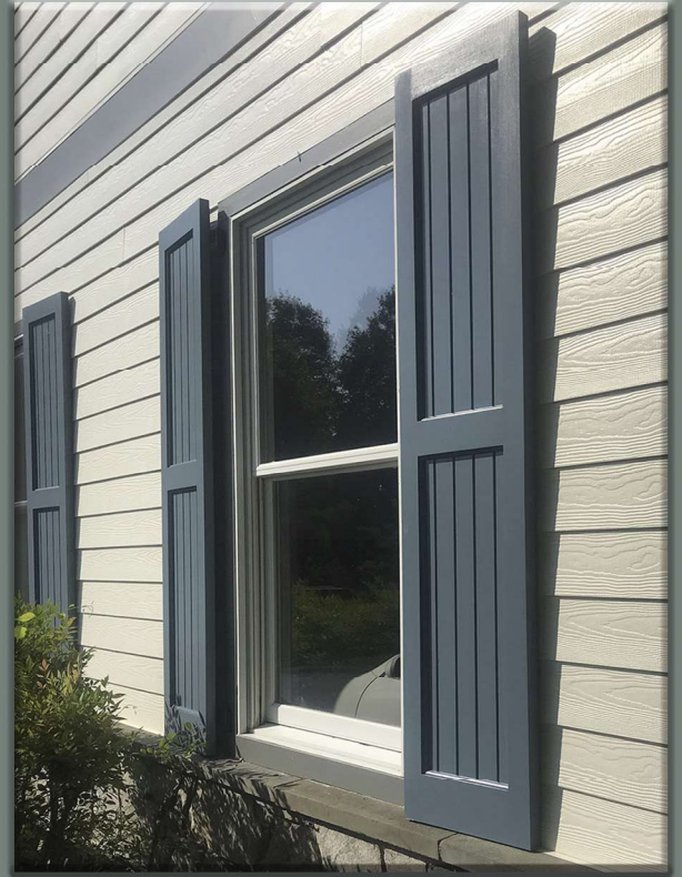
V-Groove Panel - 50/50 layout - Hidden Stay Hardware