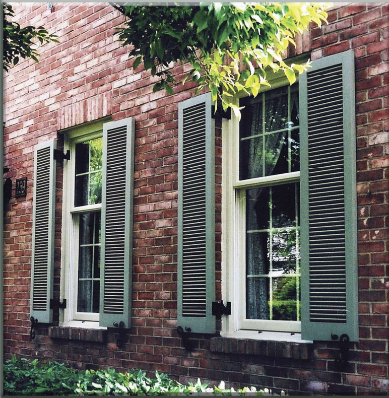
Standard Louver - 100 layout - S-Shaped Shutter Dogs