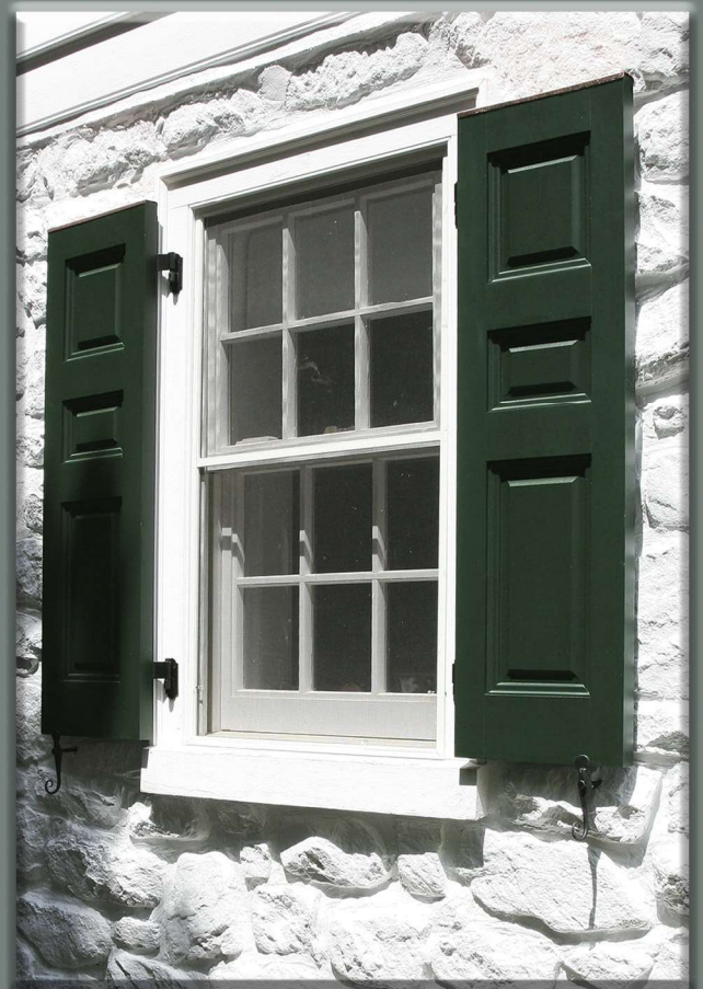
Raised Panel w/ Ogee Trim - 30/20/50 layout Curled Shutter Dogs, L-Shaped Hinges & Pintles