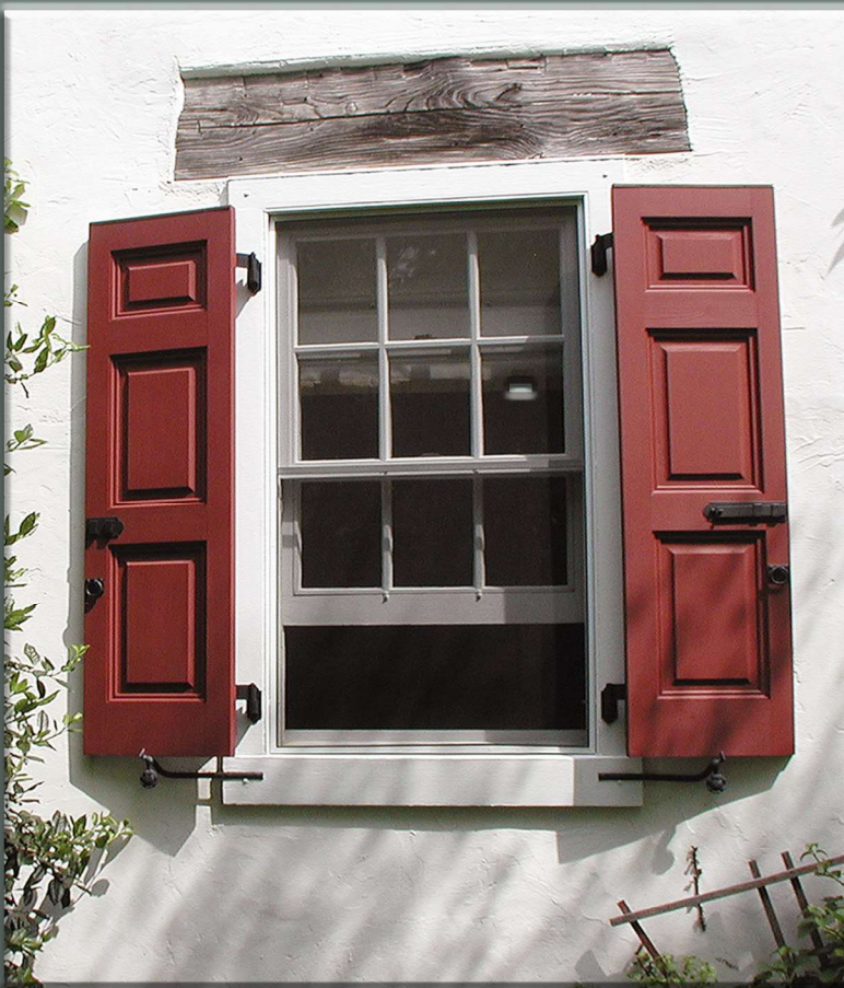
Raised Panel w/ Ogee Trim - 20/40/40 layout Grape Shutter Dogs Long Arm, Slide Bolt, Ring Pull