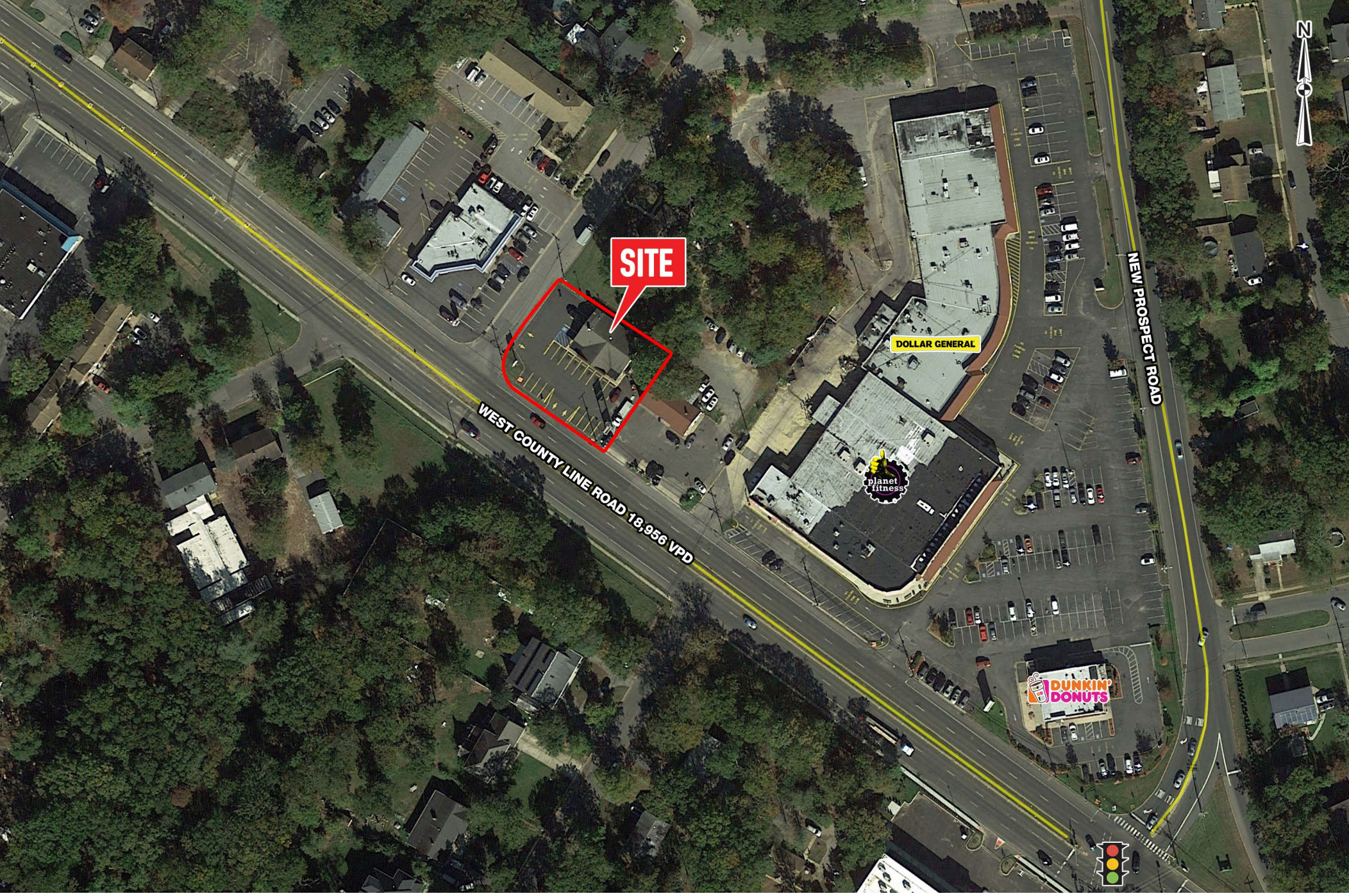
The information and images contained herein are from sources deemed reliable. However, Metro Commercial Real Estate, Inc. makes no representation whatsoever as to their accuracy or authenticity. Images shown may be modified for illustrative purposes. Images may be out-of-date and not current. 11.14.18