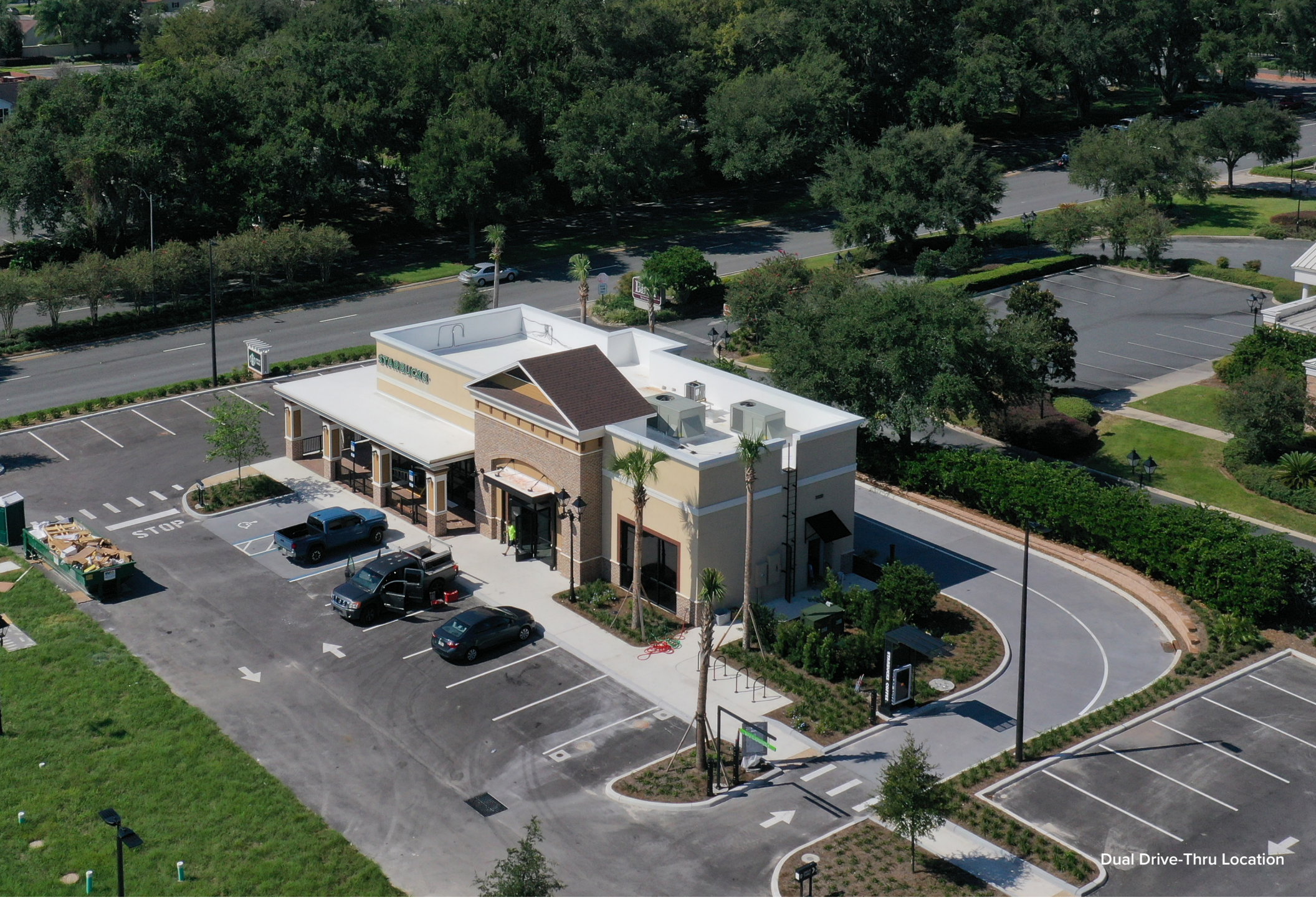
Page 5 Starbucks Coffee