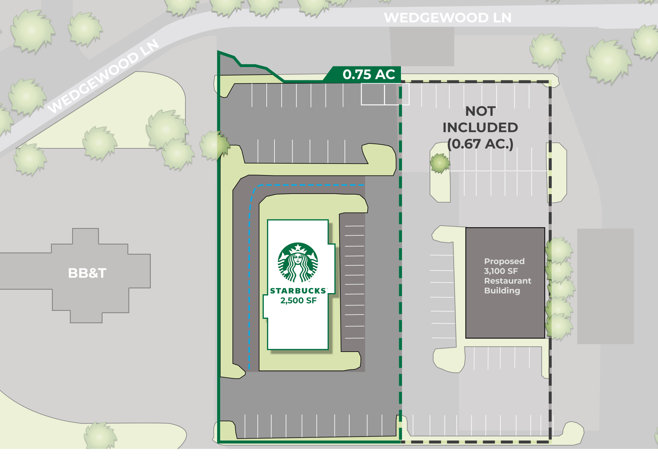
Page 11 Starbucks Coffee