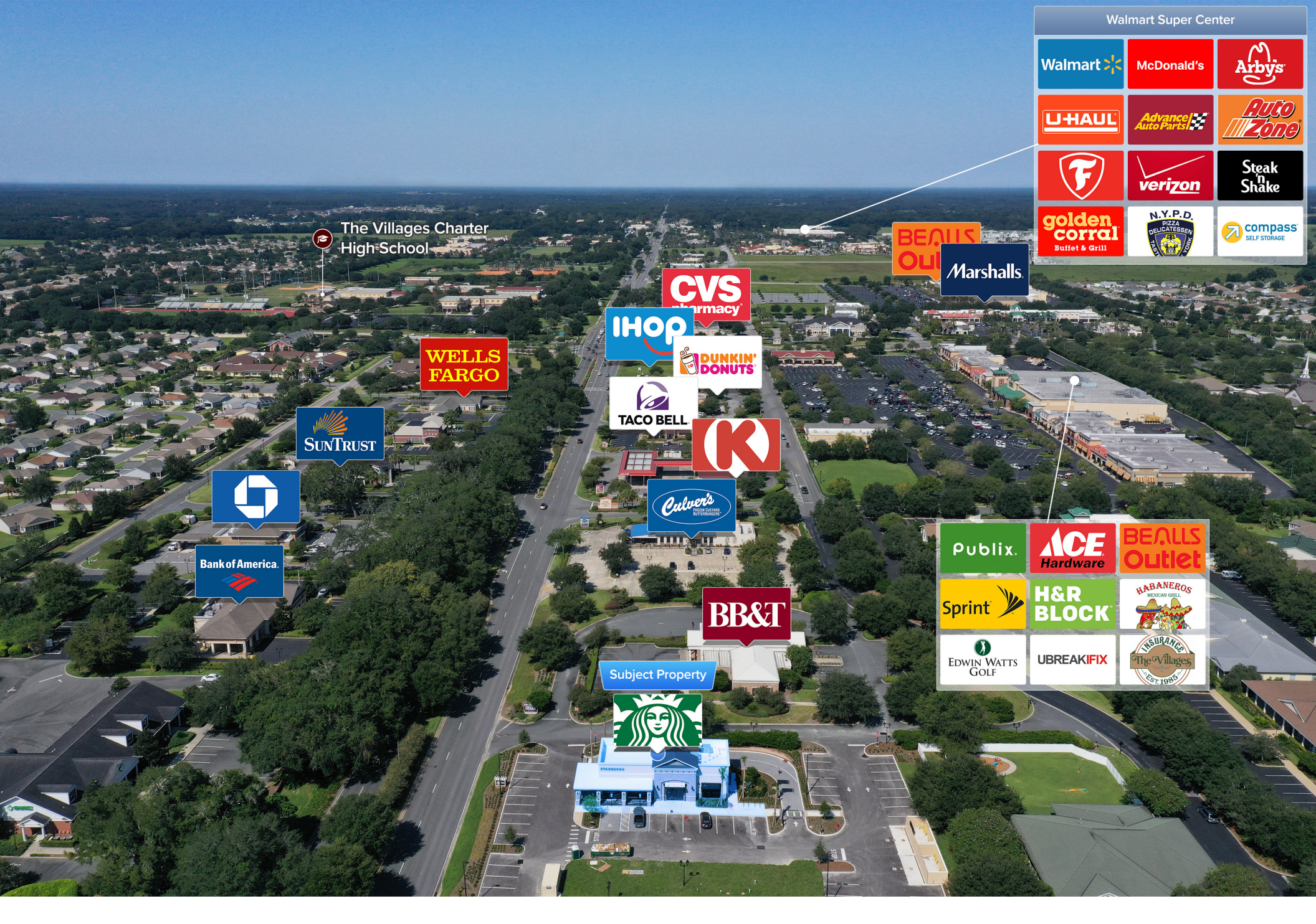
Page 10 Starbucks Coffee