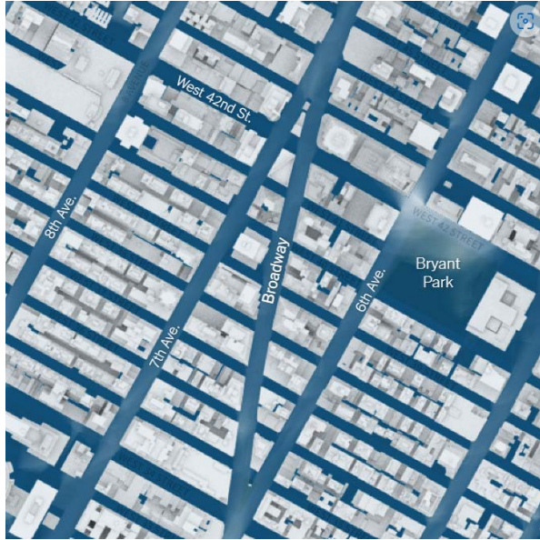
Broadway, West 42 nd , 7 th and 6 th Avenues, along with Bryant Park have virtually no natural light coming to street level during winter.

All-in-all, with the increasing number of taller buildings in the City of Allentown, it is imperative that impact analysis, especially related to height, façade design and setbacks be required for developments at the scale of the current proposal.