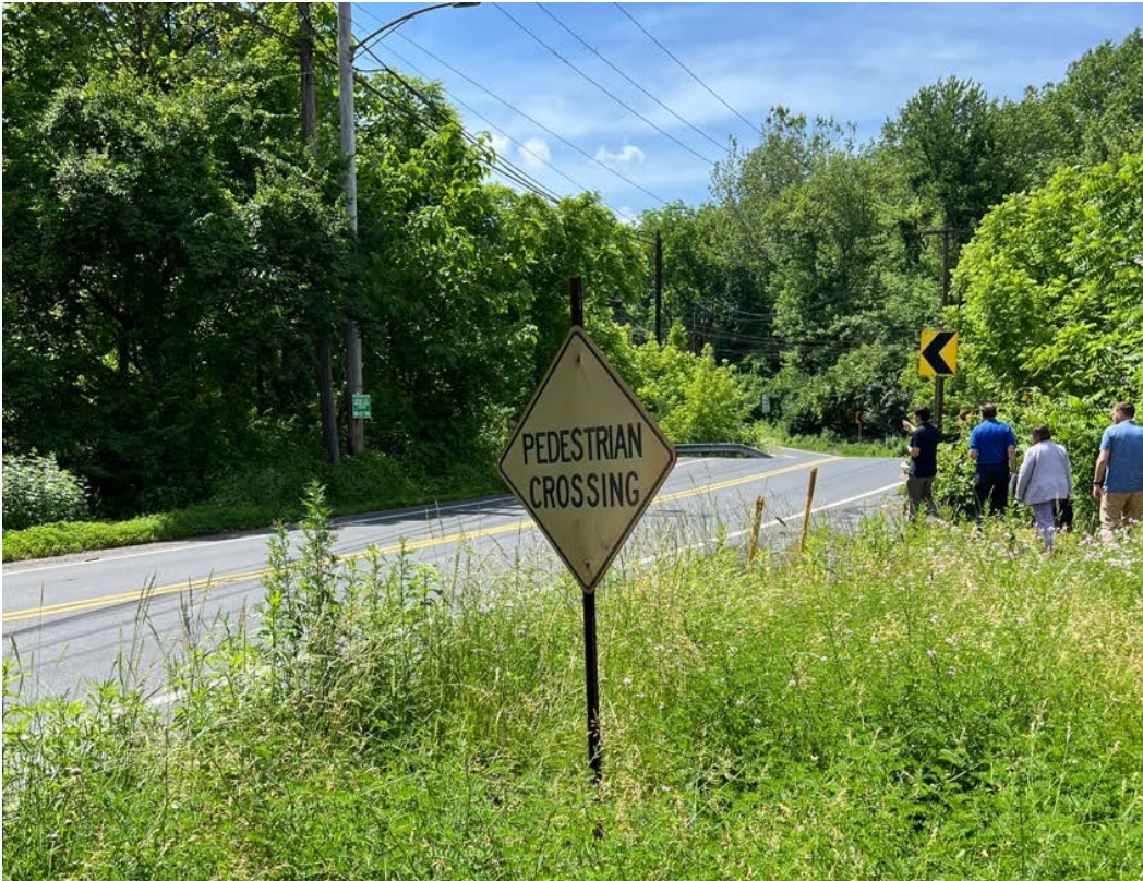
A “Pedestrian Crossing” sign is currently located near the intersection of Wood Street and Hackett Avenue, indicating an existing demand for pedestrian infrastructure in the area.

Bicycle racks should be located at convenient locations near employee entrances to accommodate bicycle commuters as a low-cost low-impact form of transportation (of FutureLV Policy 5.2).