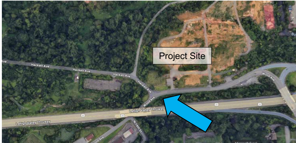
Google Maps Aerial Imagery

Hackett Avenue along the frontage of the property has a bridge that was constructed in 1912 and is identified as “fair” condition by PennDOT Bridge Key 28730. This bridge will be significantly impacted by the proposed development, creating a situation that is unsustainable. It is of note that the bridge also has a significant elevation change. An immediate plan to replace this bridge is critical for the operation of the industrial site and to keep the transportation network in a state of good repair (of Policies 2.2 and 4.6).