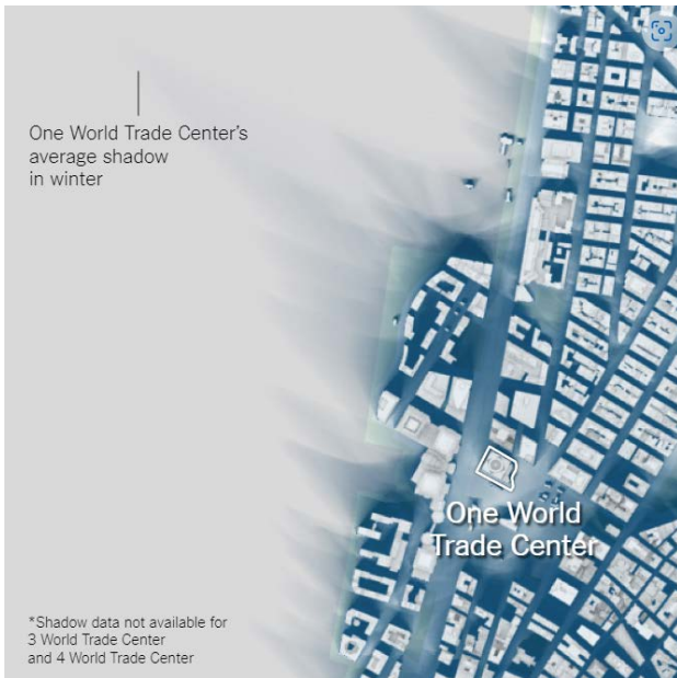
One World Trade Center is roughly 175 stories, standing at 1776 feet with its towers. Its shadow in winter extends into the Hudson River a significant distance.

Their conclusion is drawn from a series of light and air studies developed for New York City, during winter, spring, summer and fall, as an example of how the effect of a building’s height can significantly alter the character and even the economic potential of a community.