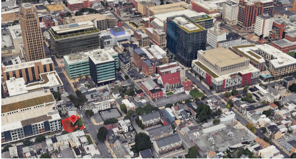
Google Earth Aerial Imagery

The LVPC will consider the subject application at its Comprehensive Planning Committee and Full Commission meetings, pursuant to the requirements of the Pennsylvania Municipalities Planning Code (MPC). Discussion on agenda items primarily takes place during the Committee meeting. Both meetings will be virtual and held on: