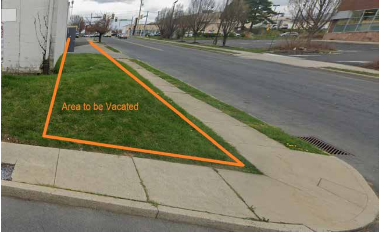
View of the frontage of 14 th Streer looking south from West Green Street