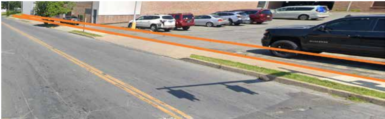
View of the frontage of 14 th Streer looking North from Tilghman Street