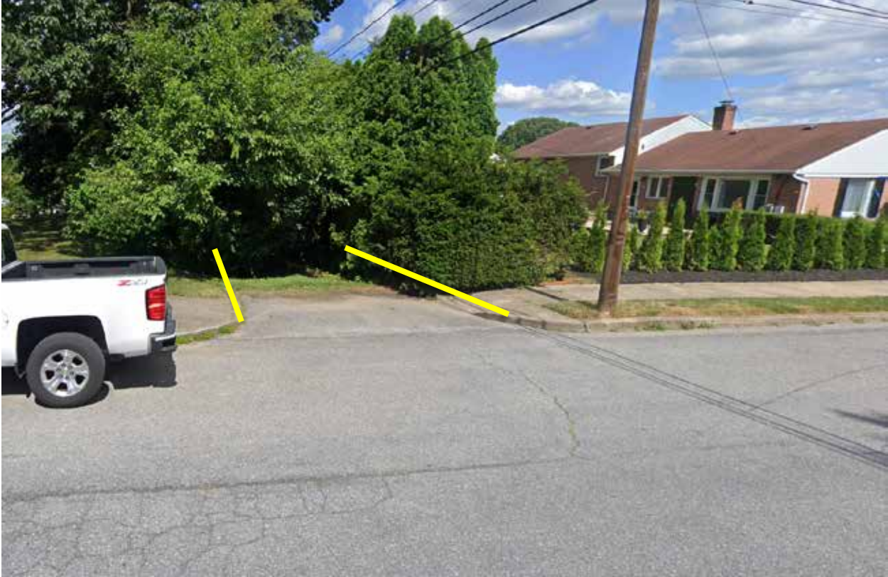
View of Hill Street looking east from South 22 nd Street Lines in yellow indicate start of area petitioned to be vacated and the approximate area of concern for ADA mobility on the sidewalk network.