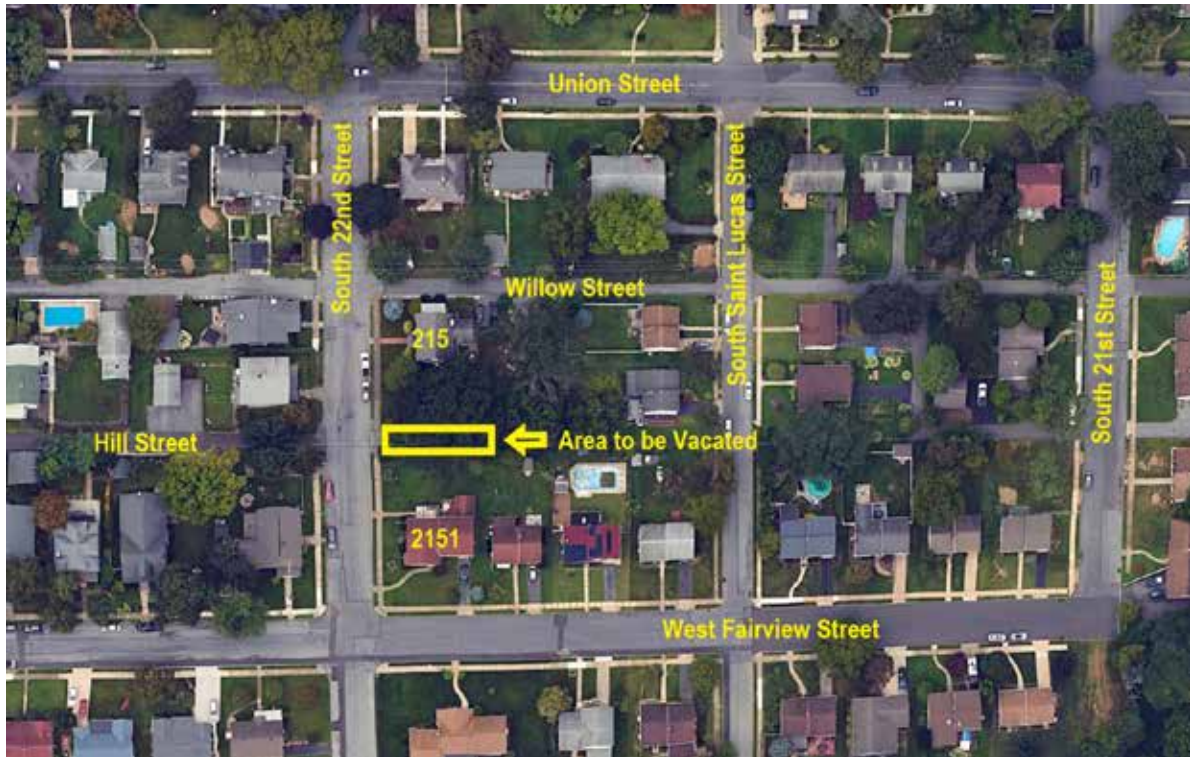
Aerial view of the area petitioned to be vacated.