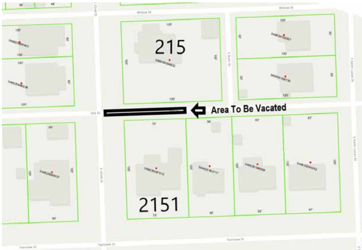
Zoomed in view of area to be vacated