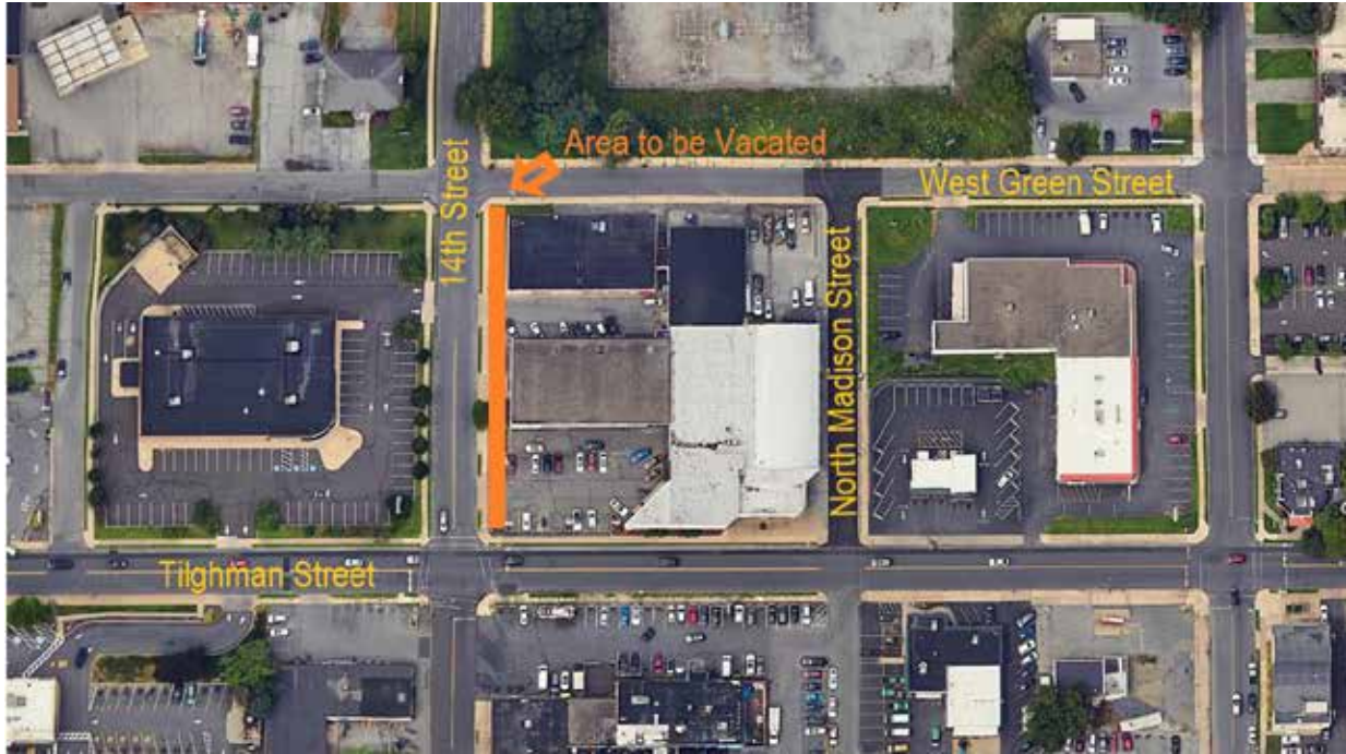
Aerial view of the area petitioned to be vacated.