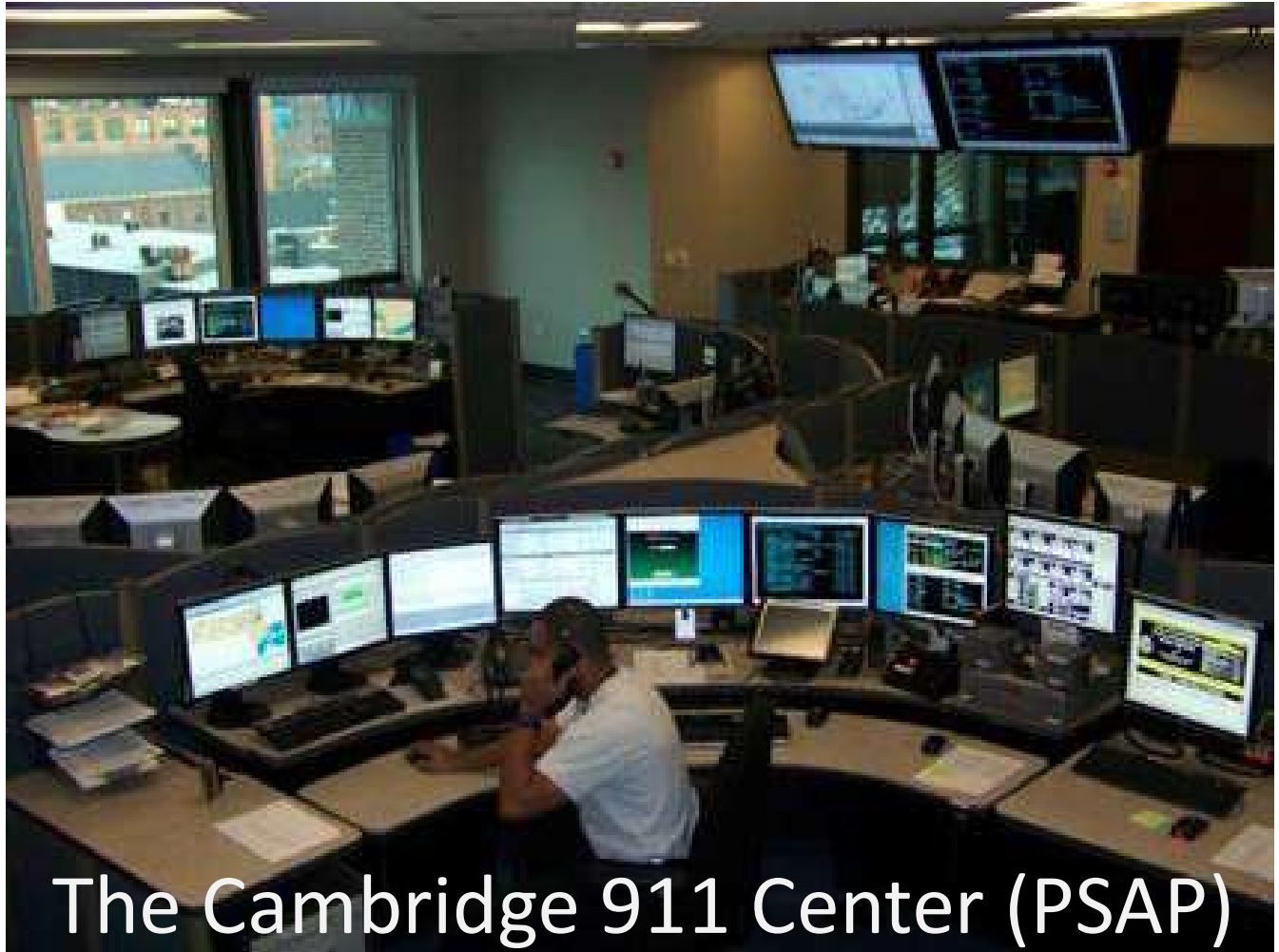
The Cambridge 911 Center (PSAP)