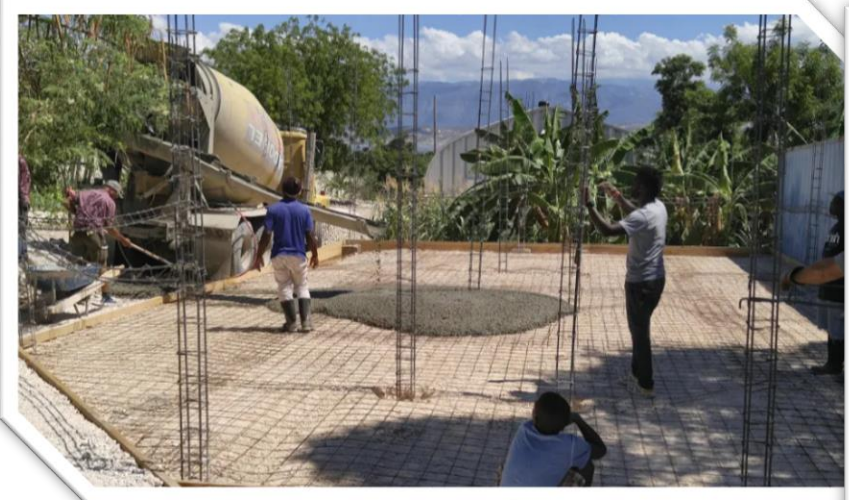
Image 3 & 4: Concrete has arrived. Local workers continue laying the 1<sup>st</sup> floor of the classrooms and building the walls. June 2018.