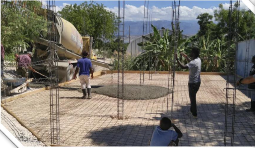
Image 3 & 4: Concrete has arrived. Local workers continue laying the 1 st floor of the classrooms and building the walls. June 2018.