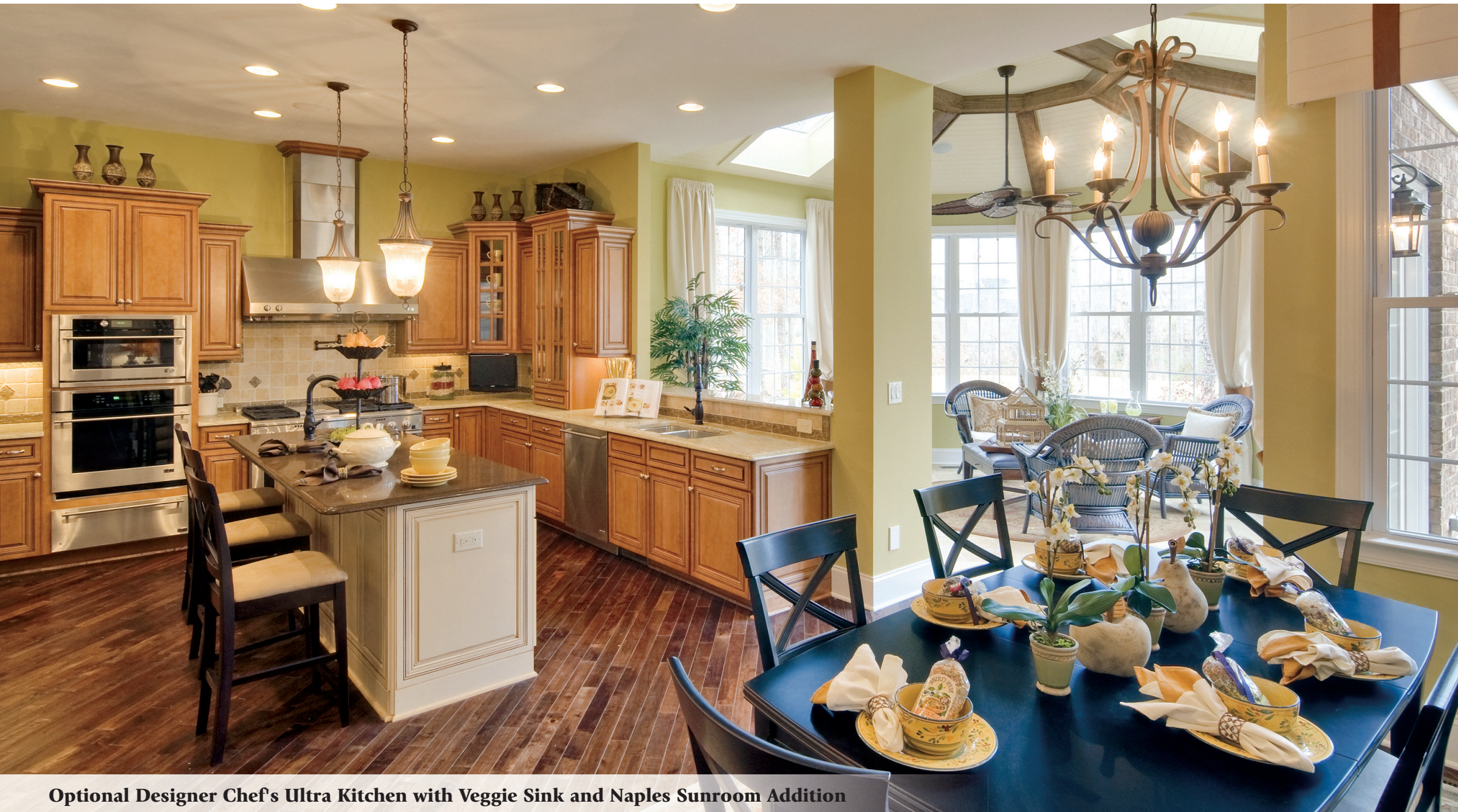
Optional Designer Chef's Ultra Kitchen with Veggie Sink and Naples Sunroom Addition