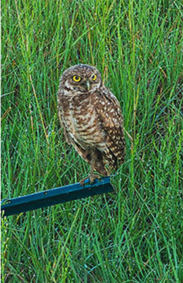
Burrowing Owl near OTOW