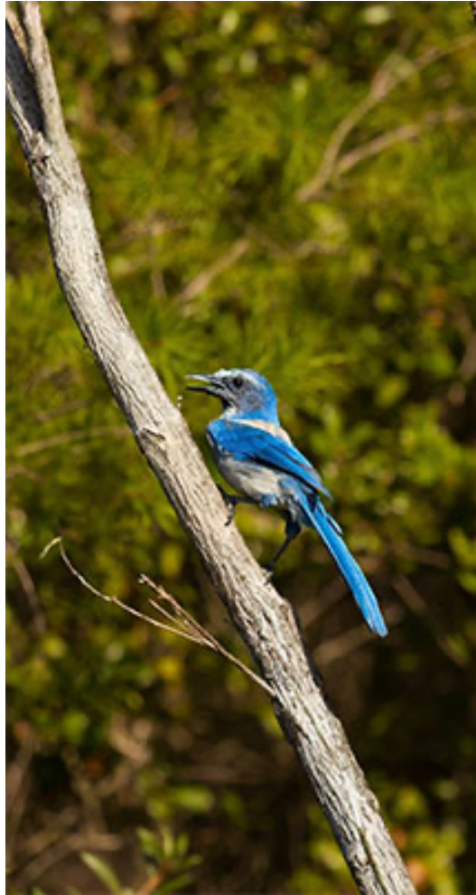
Scrub Jay in Ocala