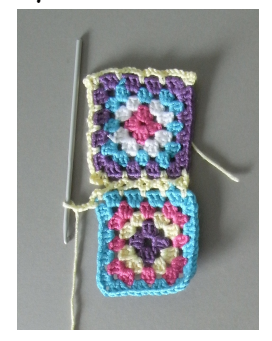
4CH,DC along the 2^{nd} side, DC, 4CH, DC into corner. 4CH,DC along the 3^{rd} side at the corner attach square 15 as before.

Continue down the column until you have attached square 25 and worked the vertical side of square 25.