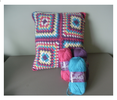
The 1st number for the centre colour, the next number for the next round etc.