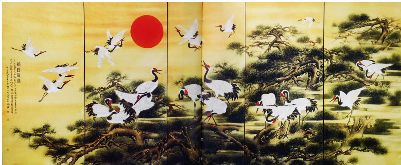
Renqiu Liu, Large Screen Set <Pine Trees and Cranes Bring Longevity>