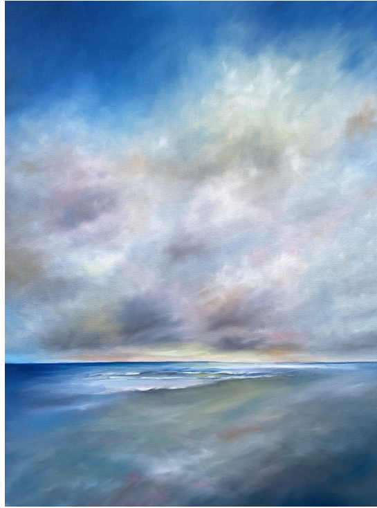
Beach Morning 40x30 available Great American Paint In project, click art for link