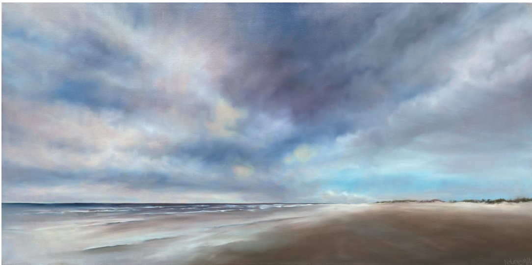
Quiet Beach Walk 20x40 $1775 UGallery, click art for link

Quiet Sky Marsh: Inspired by the marsh landscape, I apply my imagination to give familiar scenes atmosphere and mood. I use color to indicate time of day — both early morning and evening are quiet times, when the sky is most beautiful.