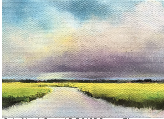
Quiet Marsh Storm I 5x7 $195 Sunset River Marketplace