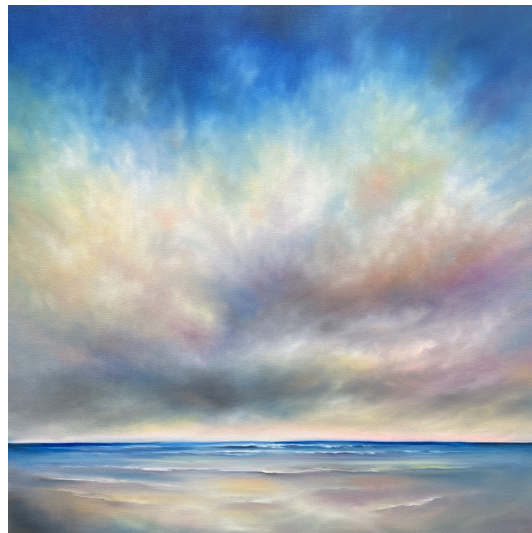
Beach Cloud Colors 40x40 $3175 UGallery, click art for link

Marsh Passage: The wetlands of coastal North Carolina offer wildlife a place of refuge and sustenance. The green summer grasses and the abundant activity of life within the marsh are wondrous to observe. This painting pays homage to this tranquil place.