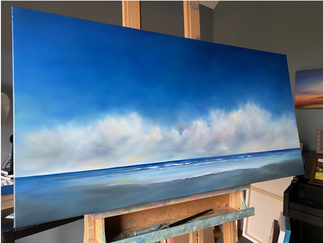
new Blue Sky Beach Clouds 24x48 oil on canvas, in my studio, email me for info

The weather is calm with a few passing clouds: Welcome Spring!