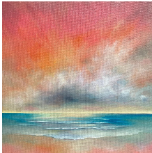
Beach Sky Colors IV 12x12 $550 website art shop

A glorious sunset makes the beach, water, clouds and sky a happy place. I use a warm, bold palette to express these colorful seascapes. Click art for links.