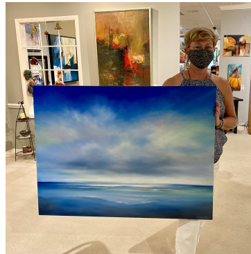
Sea Cloud Light 30x40 $1800 Sunset River Marketplace

Since 2007 I have exhibited with Sunset River Marketplace in Calabash, NC, near the SC state line. I keep my art with them fresh and current — bringing in new works every few months. Their space is large with an eclectic mix of local painters, potters and craftspeople. For more information: 910.575.5999 10283 Beach Dr SW, Calabash, NC 28467