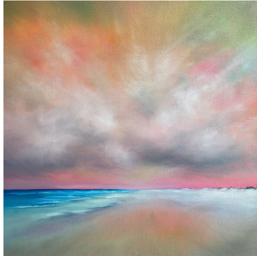
-SOLD Beach Sky Colors III 12x12 website art shop

Visit my website Art Shop where I offer paintings not available at my other galleries. Checkout is safe and secure and I offer FREE SHIPPING within the USA. If you have any questions prior to purchase, contact me at info@nancyhughesmiller.com