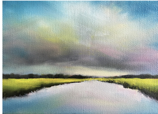
Quiet Marsh Storm II 5x7 $195 Sunset River Marketplace