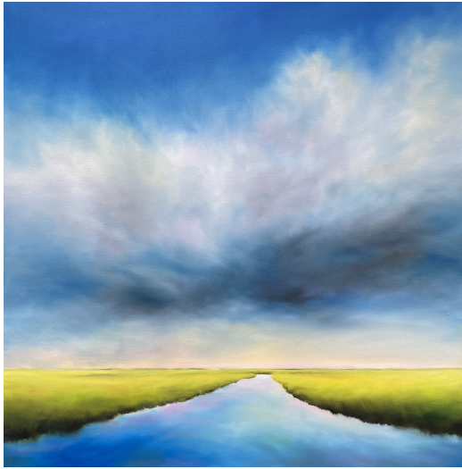
Marsh Passage 40x40 $3175 UGallery, click art for link

Marsh Passage: The wetlands of coastal North Carolina offer wildlife a place of refuge and sustenance. The green summer grasses and the abundant activity of life within the marsh are wondrous to observe. This painting pays homage to this tranquil place.