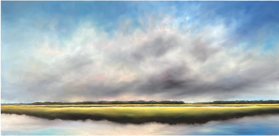
Quiet Sky Marsh 20x40 $1775 UGallery, click art for link

Quiet Sky Marsh: Inspired by the marsh landscape, I apply my imagination to give familiar scenes atmosphere and mood. I use color to indicate time of day — both early morning and evening are quiet times, when the sky is most beautiful.