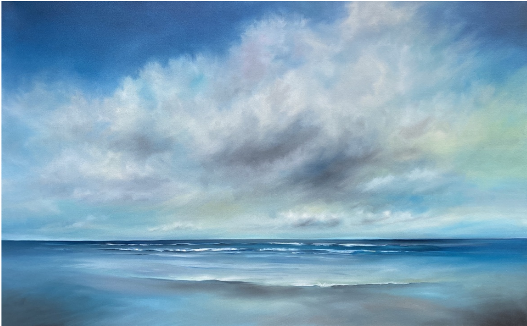
Blue Ocean Clouds 30x48 oil on canvas, VAE online auction item #130, click art to bid