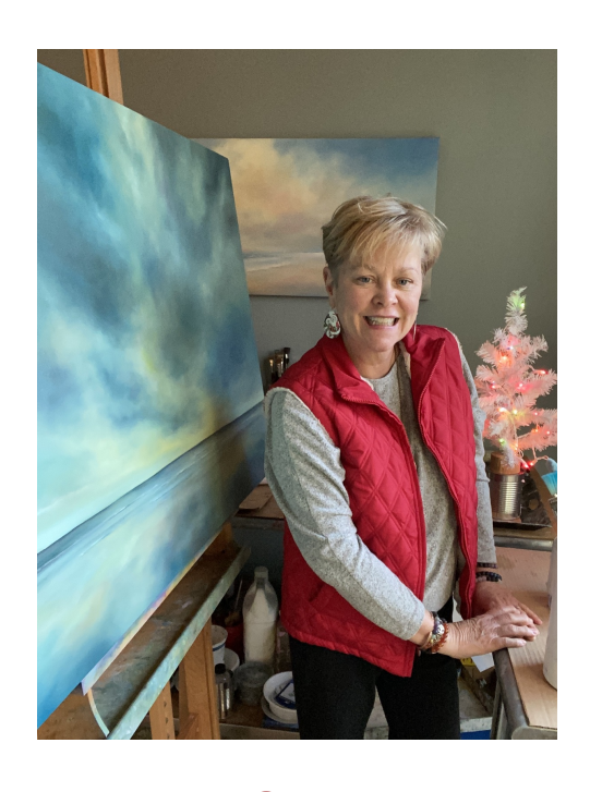
Enjoy the Holiday Season and Happy New