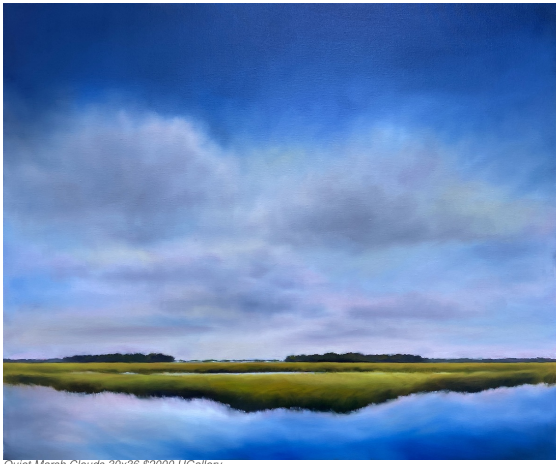
Quiet Marsh Clouds 30x36 $2000 UGallery