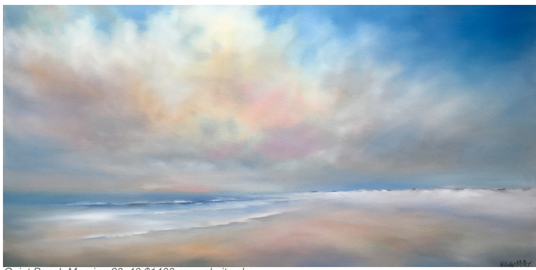
Quiet Beach Morning 20x40 $1400 my website shop