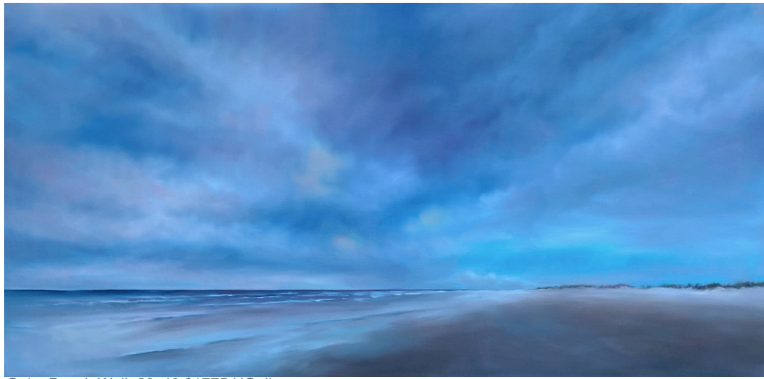
Quiet Beach Walk 20x40 $1775 UGallery