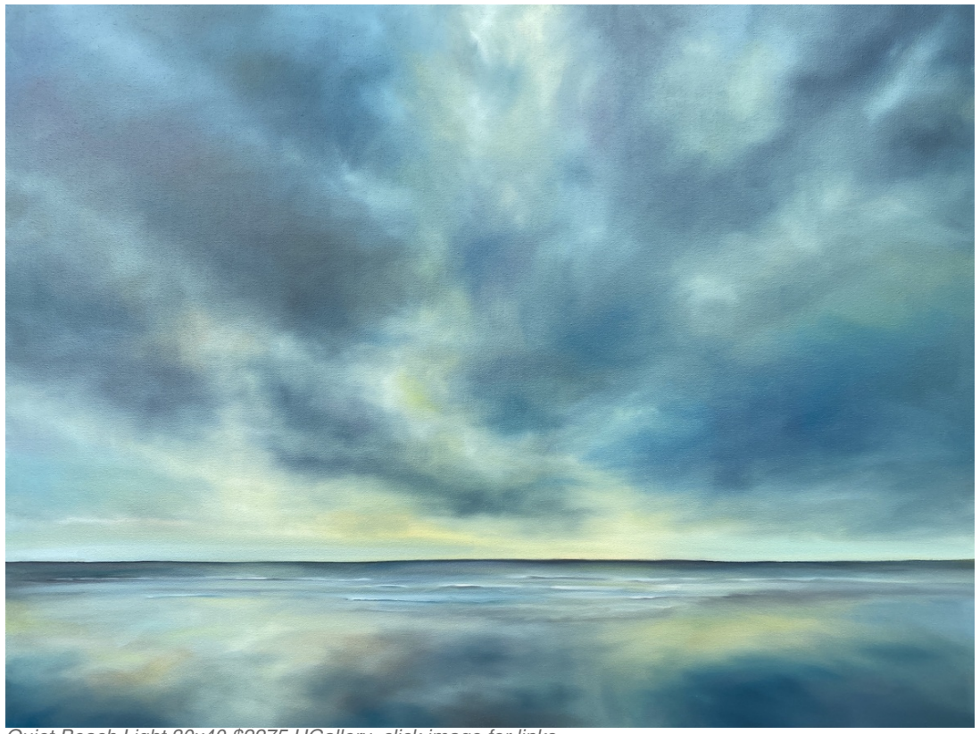
Quiet Beach Light 30x40 $2275 UGallery, click image for links

Quiet waves under clouds, hopeful light on the horizon, a passing storm, the sun will come out again