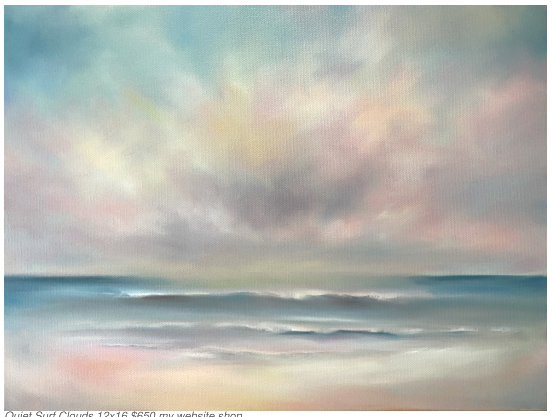
Quiet Surf Clouds 12x16 $650 my website shop