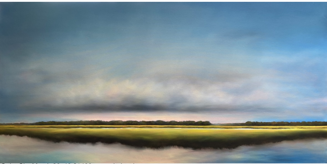
Quiet Sky Marsh 20x40 $1400 my website shop