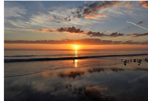
Photo taken Jan 2, 2019 at Jax Beach

Every sunrise should be a reminder of the love and light that is forever with us from our loved ones on the other side. Join us just South of the Jacksonville Beach Pier on July 24, 2021 6:30am for our Sunrise Service. Inspirational stones will be given to the survivors to toss in to the ocean, signifying the release of darkness and grief while welcoming the love and light from our loved ones in Heaven.