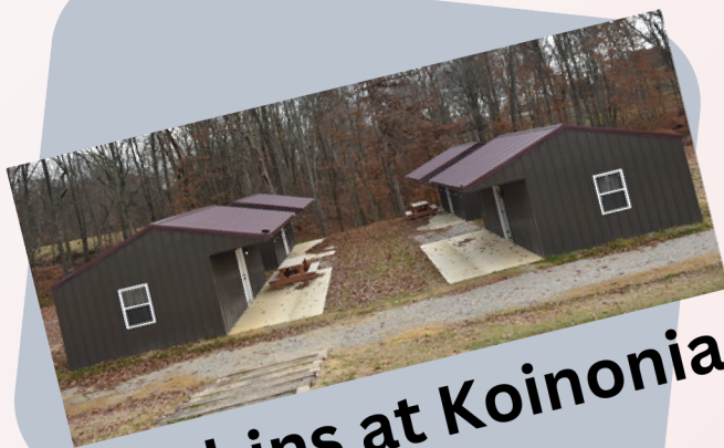
Cabins at Koinonia