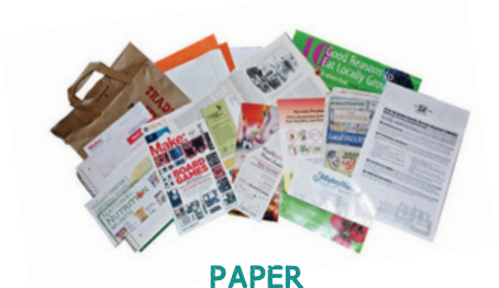
Magazines, junk mail, paper bags, office paper, newspaper, etc.

Place only these materials loose, empty, clean and dry in your recycling cart or dumpster: