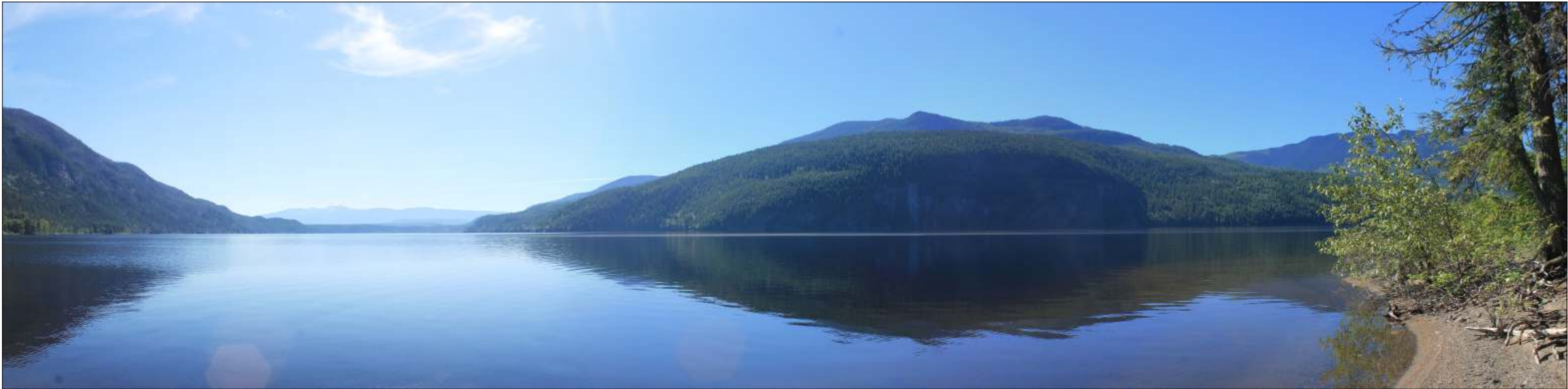
June 28, 2021 - CP5: 51 56 02.5N, 120 21 03.7W: The beach at a user maintained campsite, boat access only, photos 9811-9820 - RDI Panorama