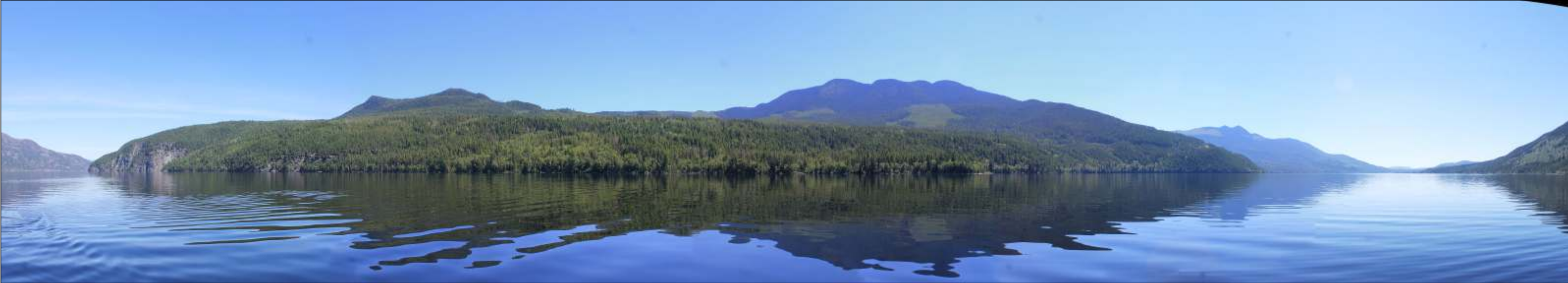
June 28, 2021 - CP4: 51 54 54.1N, 120 22 35.6W: 9936-9946 normal zoom - RDI Panorama