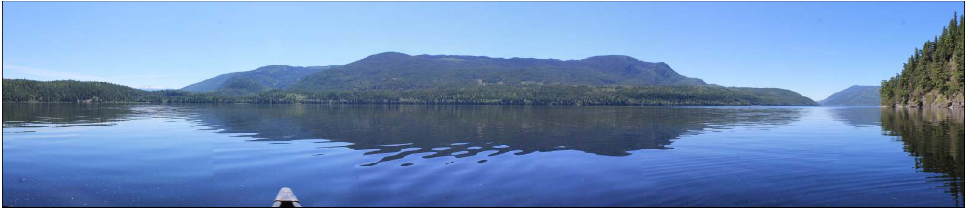
June 28, 2021 - CP10: 51 56 20.8N, 120 15 55.1W: 9910-9920 normal zoom - RDI Panorama