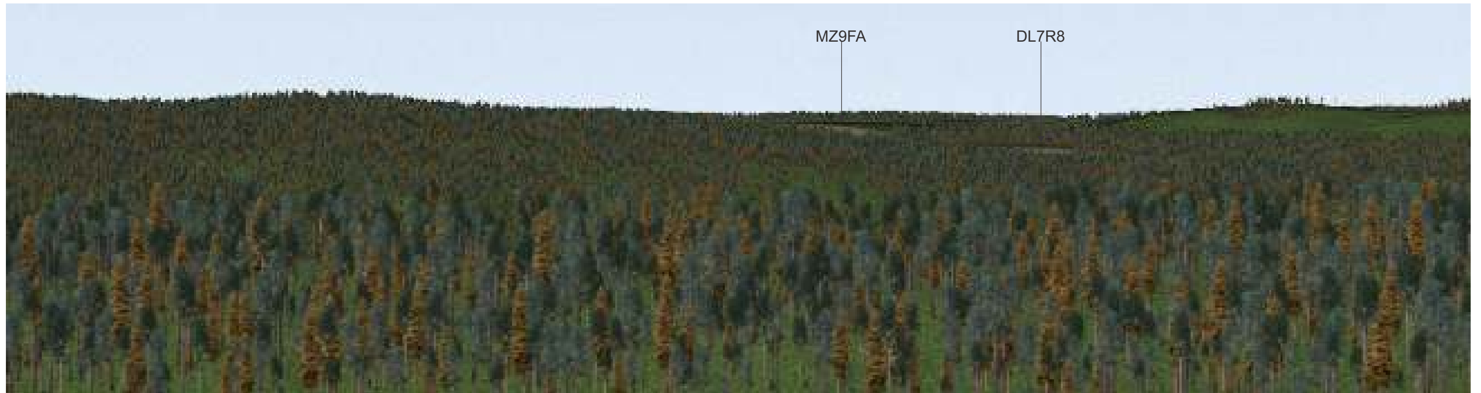
Viewpoint 22 - Close-up (20mm FOV) - Foreground Screening Removed

Viewpoints 21 and Third Canyon NVS - not provided