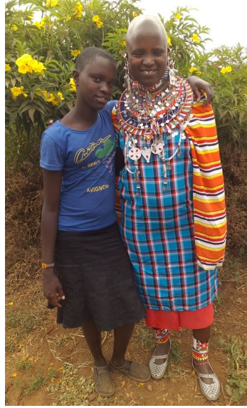
[Laseko & Mum]