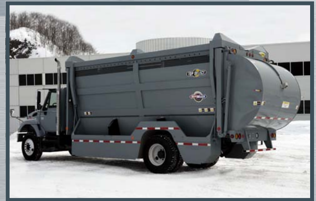
Top Select™ 2000 Maximizer