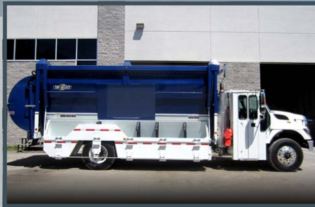
Top Select™ 1000