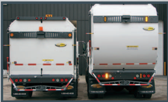
Body sizes ranging from 15-37 yd 3

THE DIFFERENT CONFIGURATIONS AVAILABLE ON AN EXPERT™ WILL STRETCH YOUR IMAGINATION