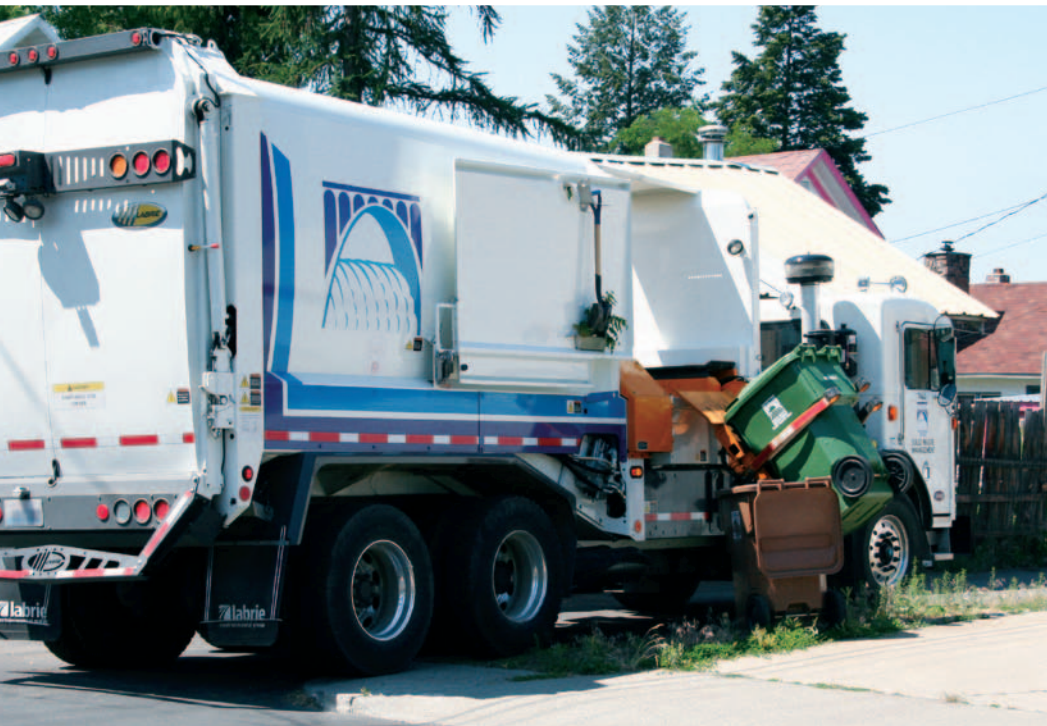
Fully automated collection, zero grab