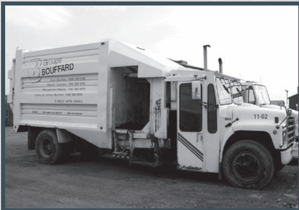
Old Expert with cart tipper

In 2006, Labrie completed redesigned Expert body to meet the demands of an ever evolving industry allowing for friendlier configuration of many options and making the Expert™ even more versatile.