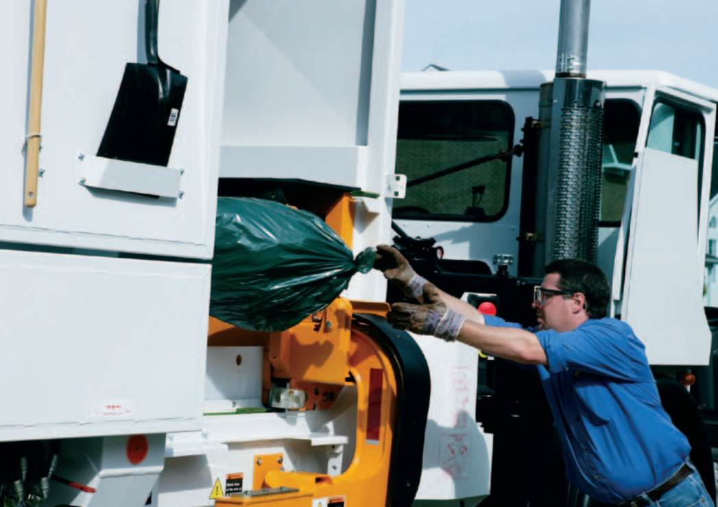
Handloading "extras" on an automated route