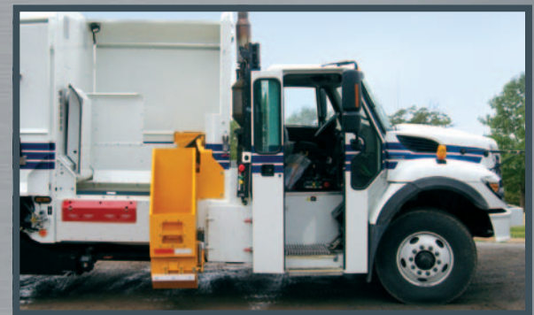
SSO bucket tipper with cart attachment for manual or semi-automated organic collection