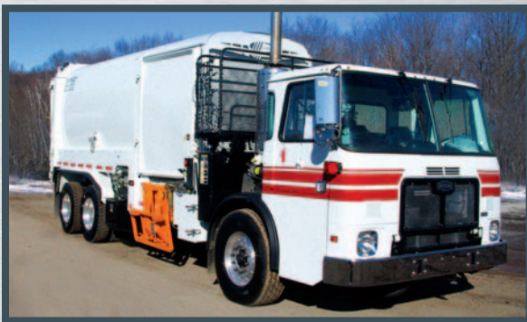
Single or dual cart tippers available curbside and/or street side

The Expert Dual Helping Hand™ configuration is an excellent way to increase productivity and efficiency for alleys, dead ends and one-way street collection. This configuration also increases safety by reducing or eliminating the need for "Back-ups", which account for more than 50% of industry related accidents.