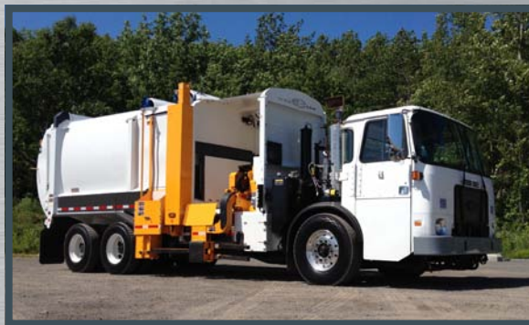
3 yd 3 or 5 yd 3 glass compartment for separate glass collection