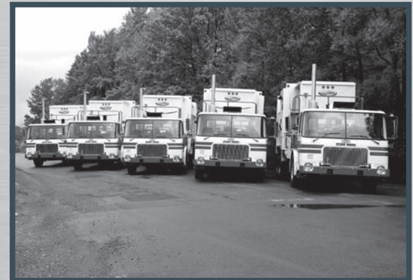
Napa Valley, CA Expert™ fleet