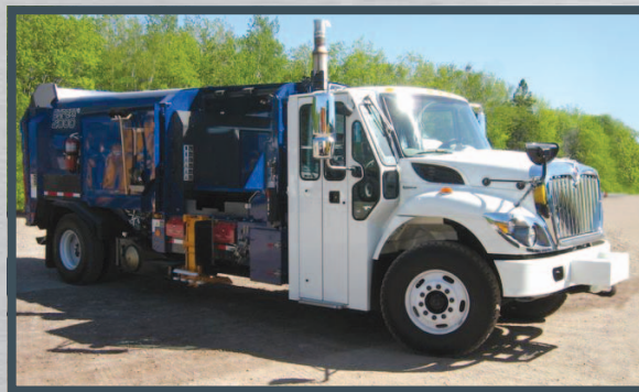
17 yd 3 Expert split body