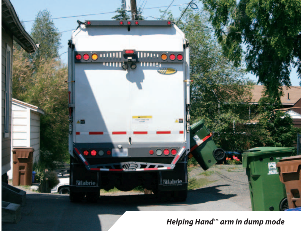
Helping Hand™ arm in dump mode