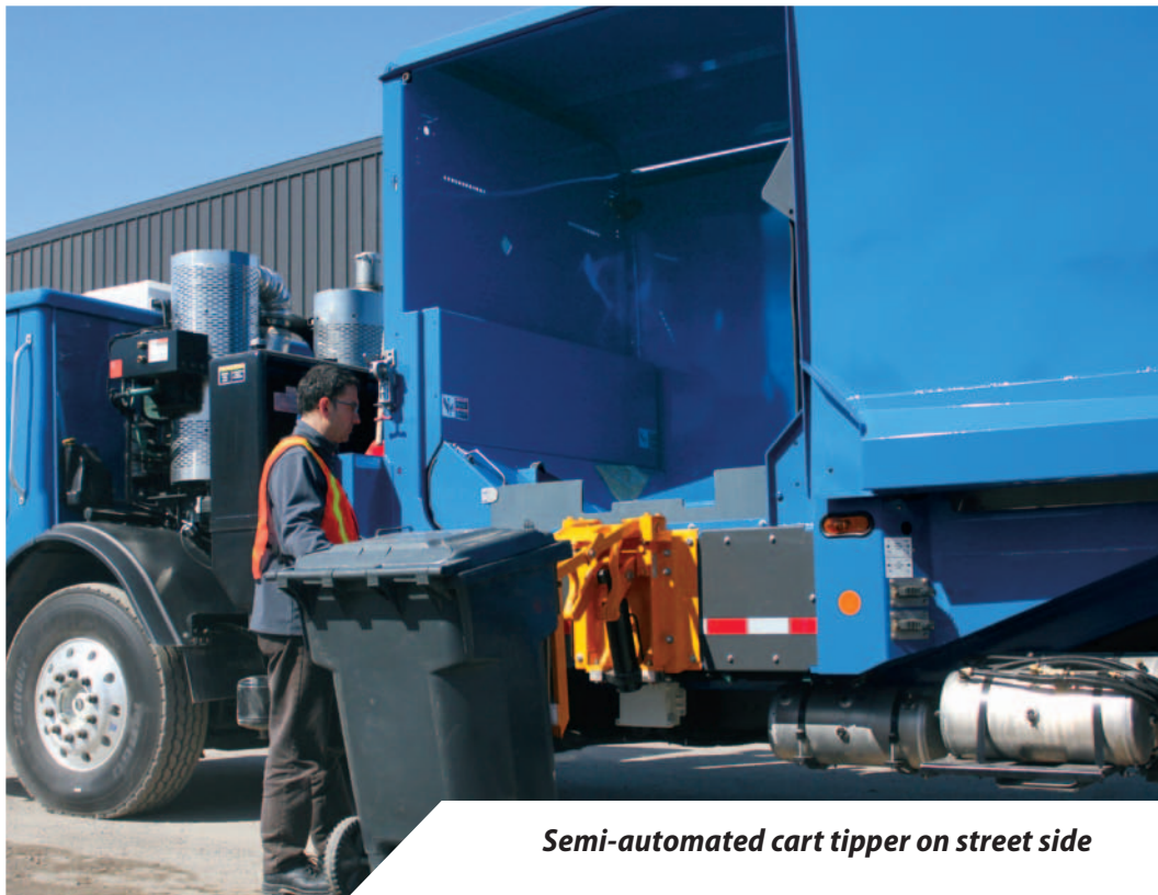
Semi-automated cart tipper on street side