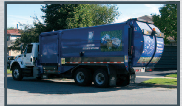
60/40, 40/60 or 50/50 split bodies with single or split chute inside the hopper