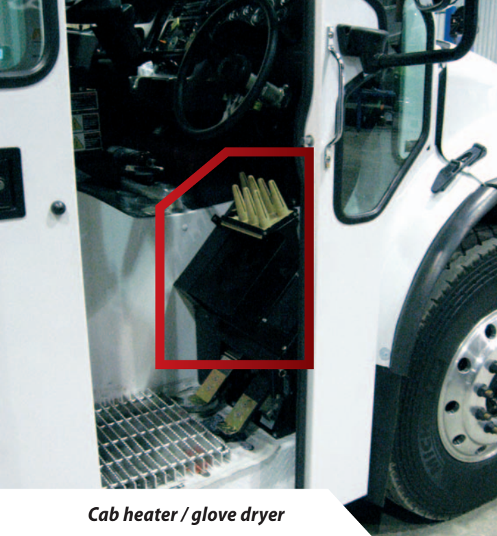
Cab heater / glove dryer