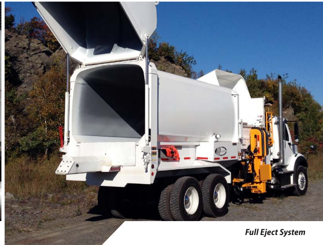
Full Eject System