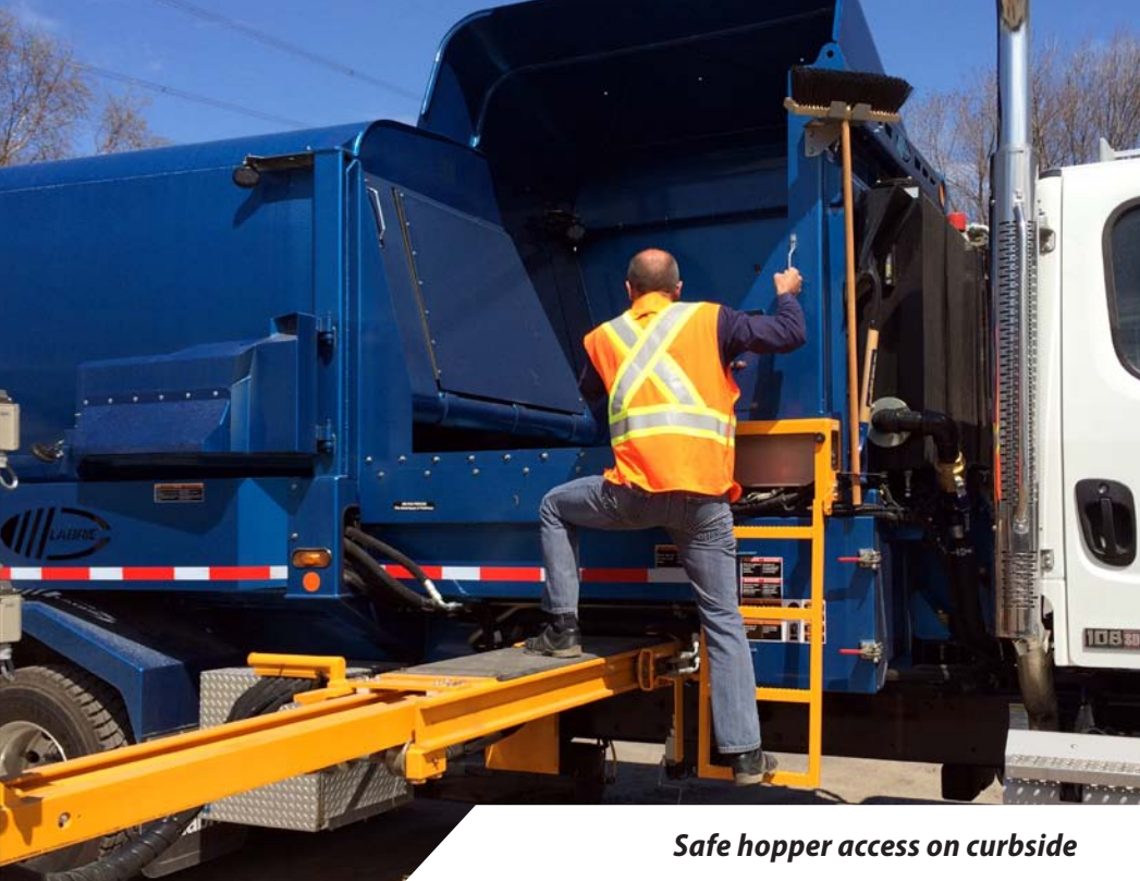
Safe hopper access on curbside