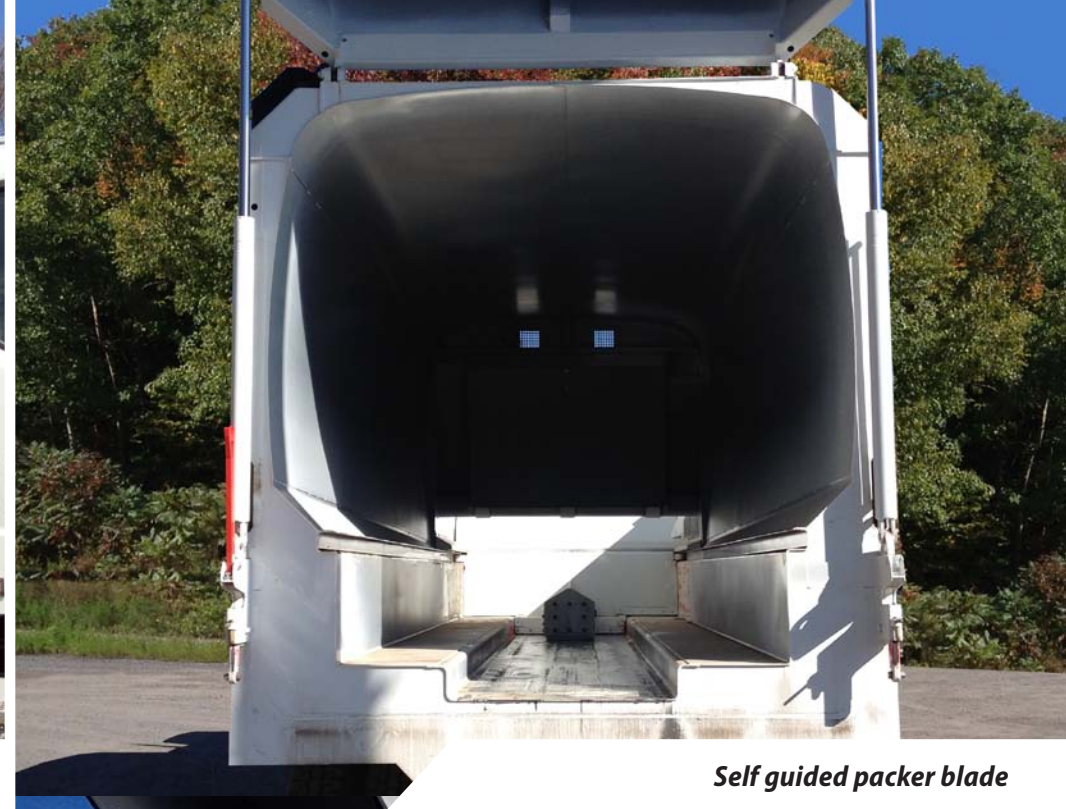
Self guided packer blade