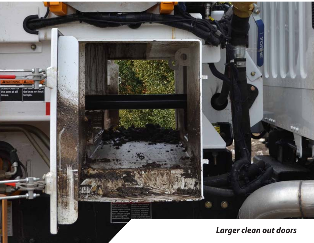
Larger clean out doors