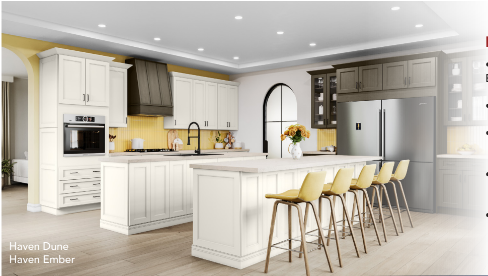
Haven Dune Haven Ember