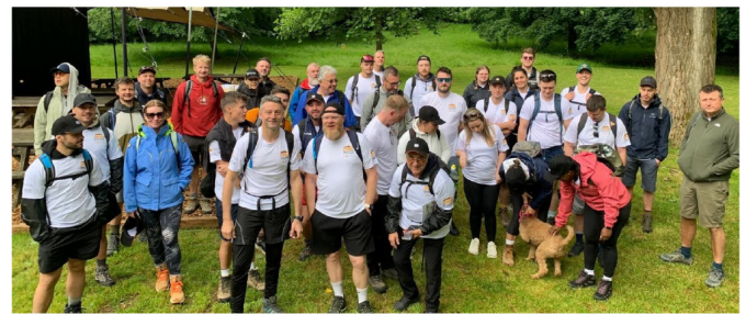
The wonderful crew of Hague Dental prepare to take on the Surrey 3 Peaks