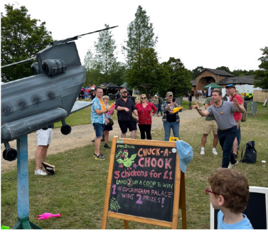
Dermot O'Leary chucks a chook in a chinook