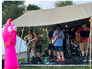
Achtung Babies rock out at We Have Ways