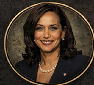
KAMALA HARRIS PIONEER