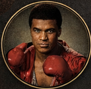
MUHAMMAD ALI CHAMPION

Celebrating Excellence. Resilience. Legacy.