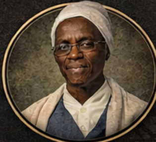
SOJOURNER TRUTH MVP