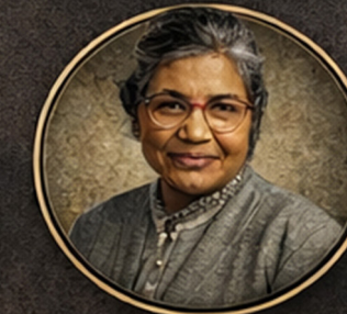
ROSA PARKS DETERMINED