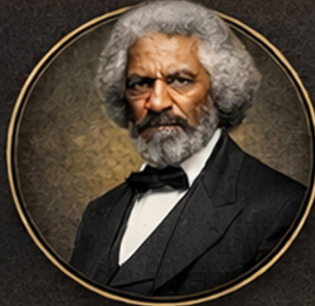
FREDRICK DOUGLASS ADVOCATE