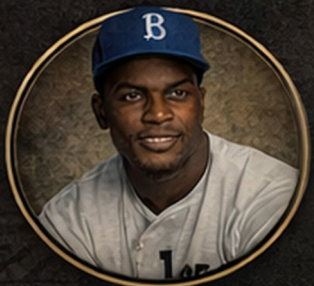
JACKIE ROBINSON ALL-STAR