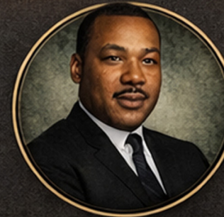
MARTIN LUTHER KING JR. LEADER