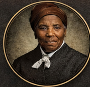
HARRIET TUBMAN RESILIENT