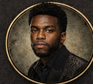
CHADWICK BOSEMAN HEROIC