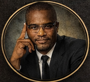
MALCOLM X EMPOWERING