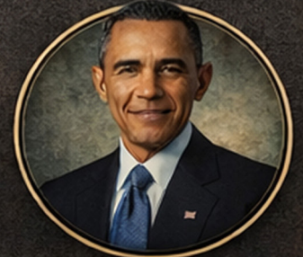
BARACK OBAMA MOTIVATOR