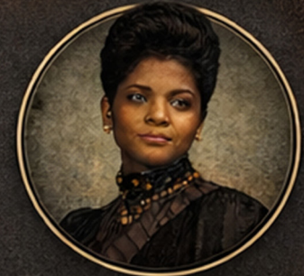
IDA B. WELLS OUTSPOKEN