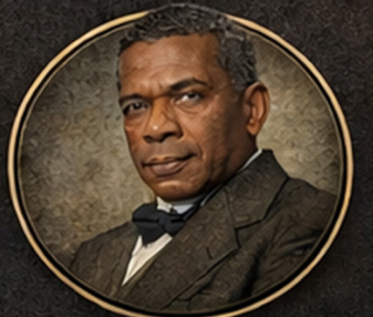
BOOKER T WASHINGTON CREATIVE