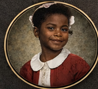
RUBY BRIDGES BRAVE