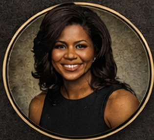
MICHELLE OBAMA INSPIRING