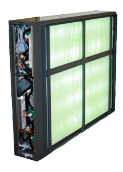
IAQ Solutions Photocatalysis TM Providing Green Environmentally Sound Engineered Solutions

This 2008 CU unit is designed to be installed in the Supply ductwork of any rooftop or air handling unit downstream of the particulate filtration and after the evaporator coil. Installation must be completed by qualified service personnel.