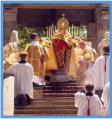
Corpus Christi, 2022

8:00am Sunday Mass moves to Our Lady of Good Help . No change to other Masses.