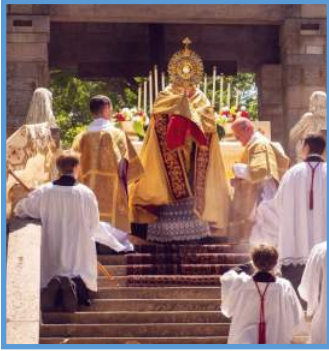
Corpus Christi, 2022

The parish will celebrate the great feast of Corpus Christi with two processions.