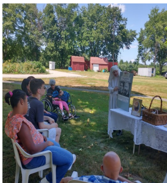
The OLGH St. Theresa's SPRED group at a presentation by Sister Grace on the life of the Little Flower.