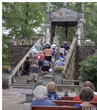
The Holy Stairs represent the 23 steps climbed by Jesus into the praetorium in Jerusalem to be judged by Pontius Pilate.