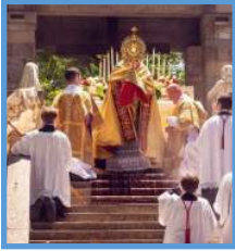
Corpus Christi, 2022

The parish will celebrate the great feast of Corpus Christi with two processions.