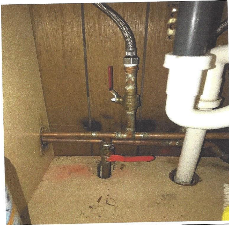
Bottom Valve Is The Drain Valve For The Sink In The Bathroom With The Heater- Shown In The Closed Position. Put In Line With The Pipe To Drain