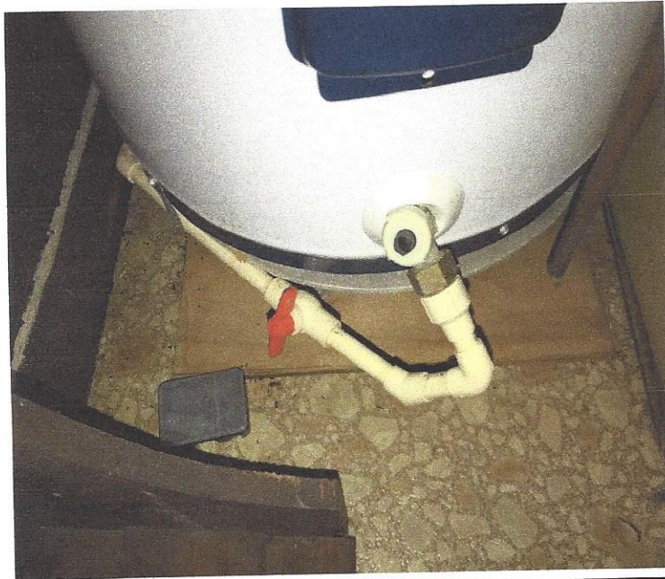
Bottom Hot Water Heater Drain Valve (Closed Position) Put Valve In Line With Pipe To Drain