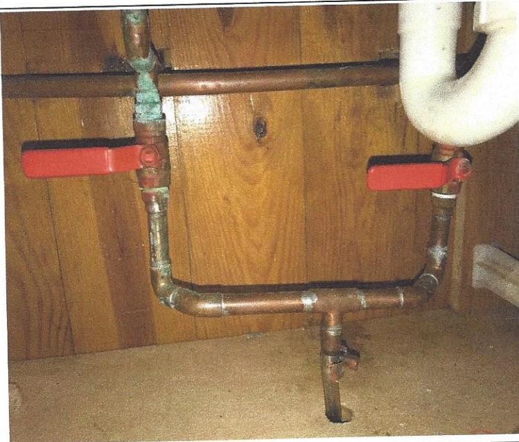
Drain Valves For The Sink In The Bathroom With The Shower. Shown In The Closed Position. Put In Line With The Pipe To Drain.