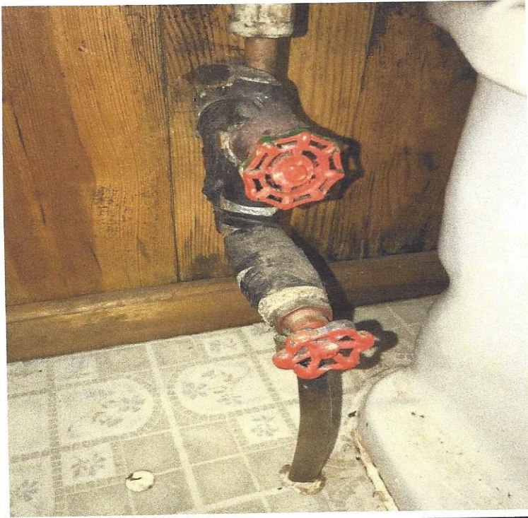
Drain Valve For the Toilet In The Bathroom With The Shower. Open Bottom Valve To Drain.