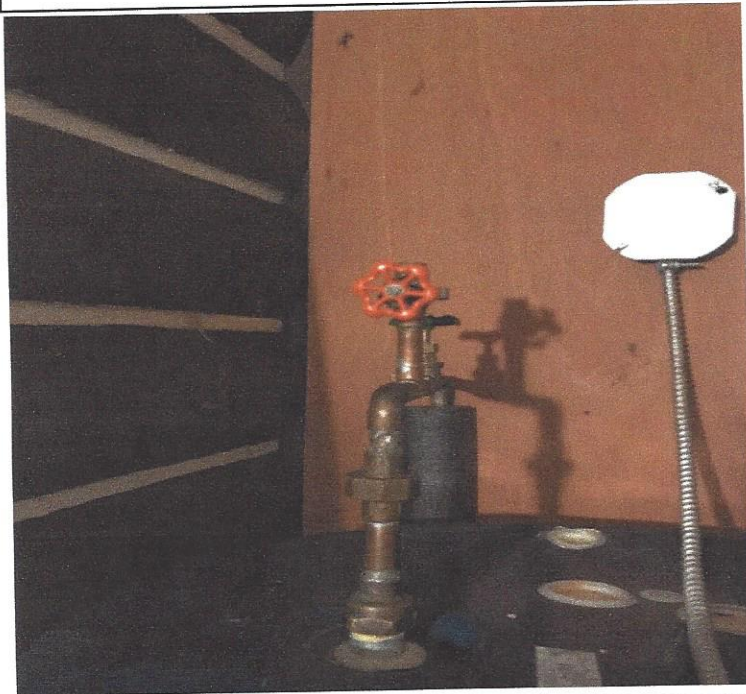
Top Hot Water Heater Drain Valve