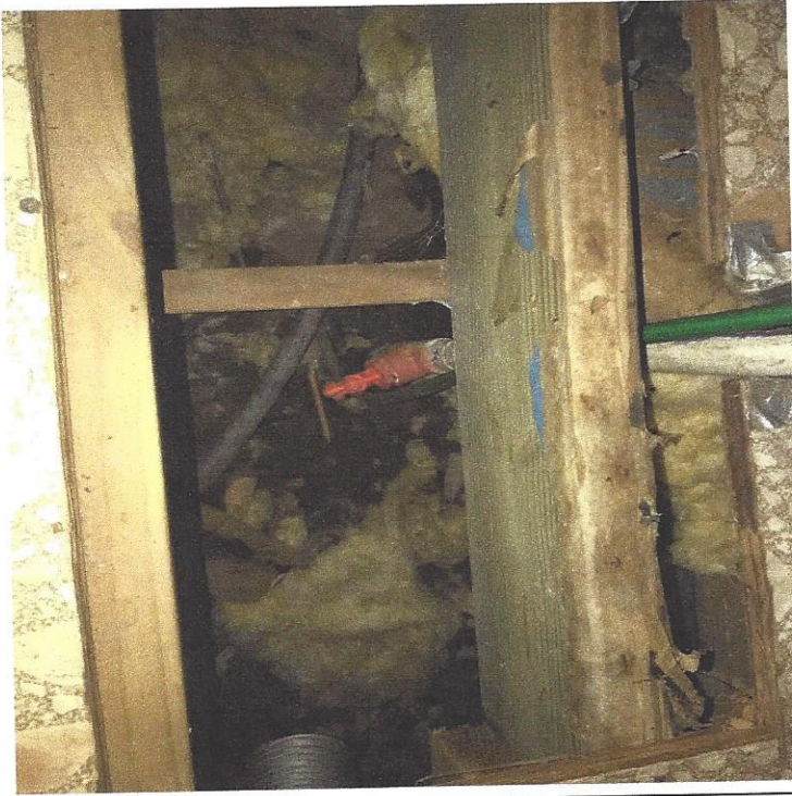
Drain Valve Under Floor In Back Room