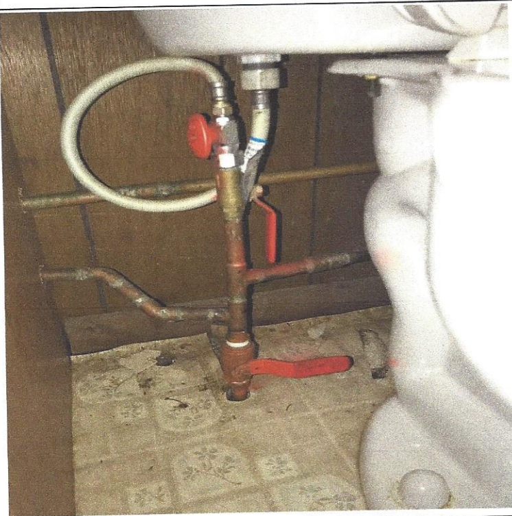
Bottom Valve Is The Drain Valve For Toilet in Bathroom With Heater- Shown In The Closed Position. Put Valve In Line With Pipe To Drain.