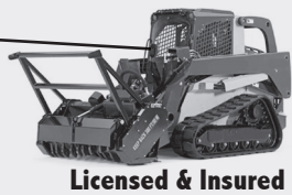
Licensed & Insured

Dirt Work Excavator Work Extreme Bush Hogging & Mulching