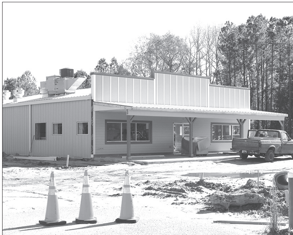
The new location of The Sheik is scheduled to be completed by the end of February. The construction process has gone well and actually looks like a building now. The new location is on US Highway 1 south of Callahan on the left hand side of the road, right past the traffic light on 5th Ave.