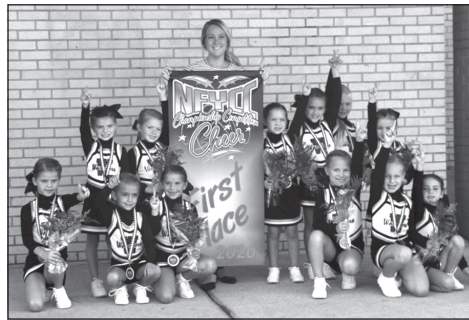
6U Gold Level 1 Small: 1st Place in their division with overall highest score in 6U. The girls had the 5th highest score of the entire competition.

The North Florida Youth Cheer Competition Cheerleading was held at West Nassau High School Saturday and Sunday, November 14 and 15. All of the little Warrior teams placed! Congratulations!