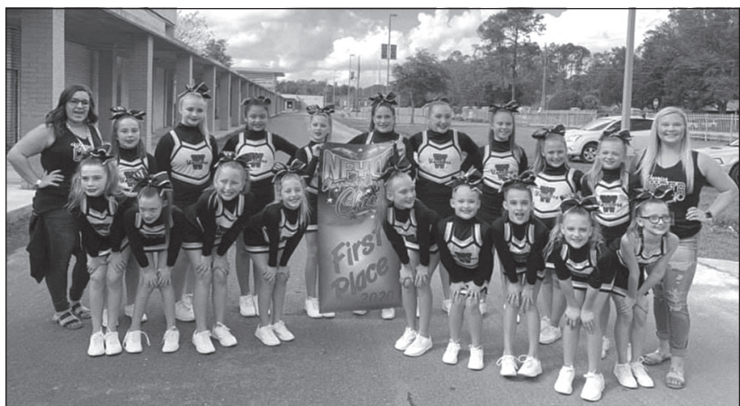
12U Level 2 Large: 1st Place in their division with overall highest score in 12U.