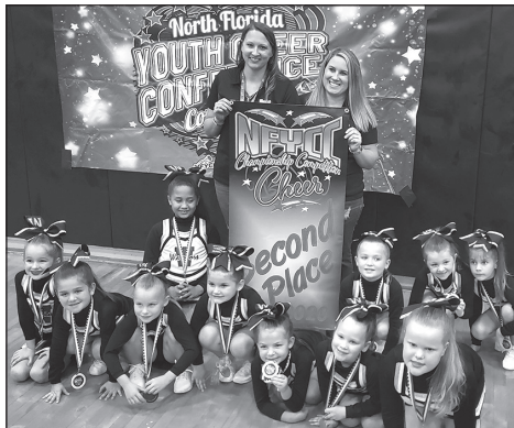
6U Red Level 1 Small: 2nd Place in their division.