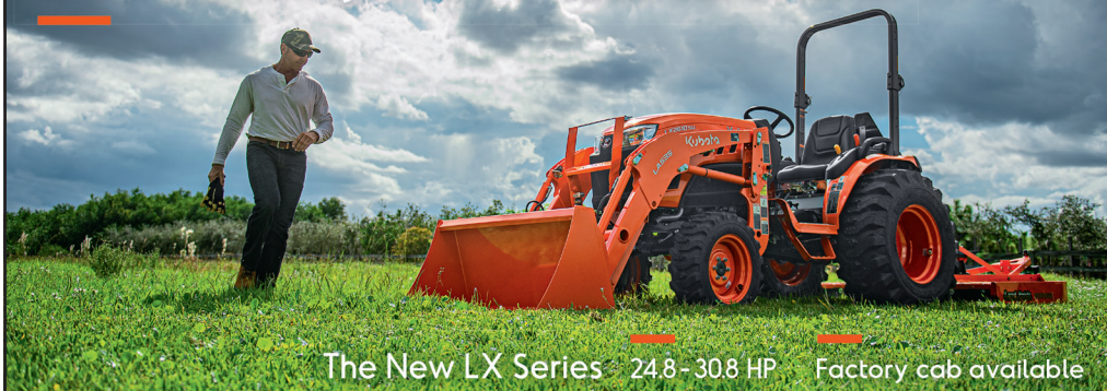
The New LX Series 24.8-30.8 HP Factory cab available

Save more on the comfortable new LX Series. Optional air-conditioned and heated cab. Large open-station platform. Stop in for a demo today.