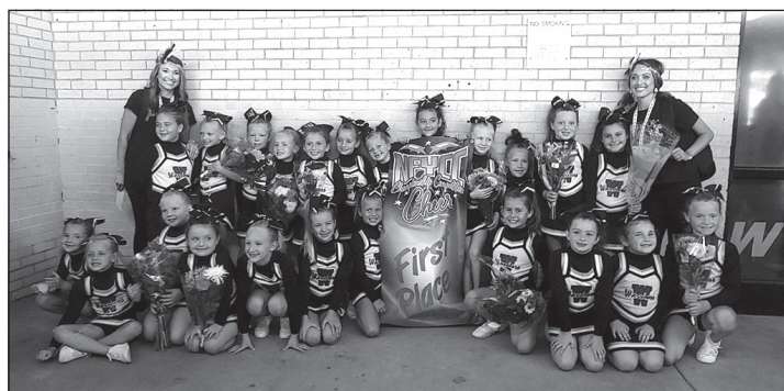
8U Level 1 Large: 1st Place in their division with overall highest score in 8U.