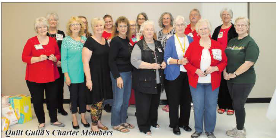
Quilt Guild's Charter Members