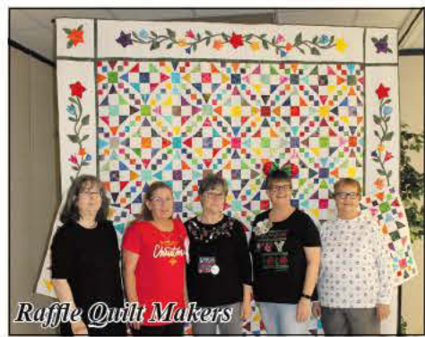
Raffle Quilt Makers