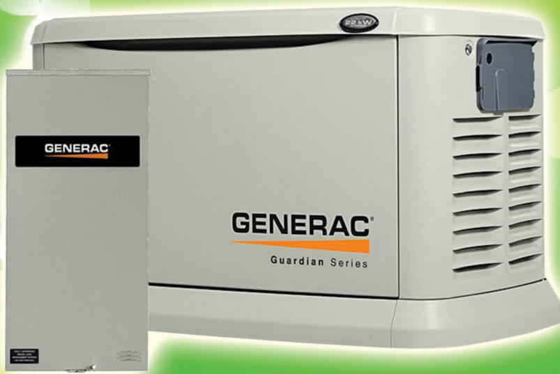
22KW Whole Home System

Sarge Says: Hurricane Season is right around the corner.