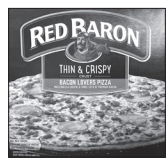
Red Baron Pizza Bacon Lovers