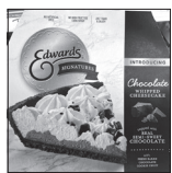
Edwards Pies Chocolate Cheesecake

Expires 8-2-22 WJ While Supplies Last With this Coupon