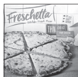
Freschetta Pizza Five Cheese