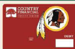
West Nassau Warriors