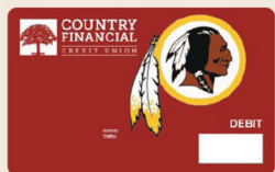
West Nassau Warriors