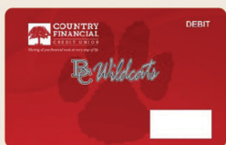
Baker County Wildcats