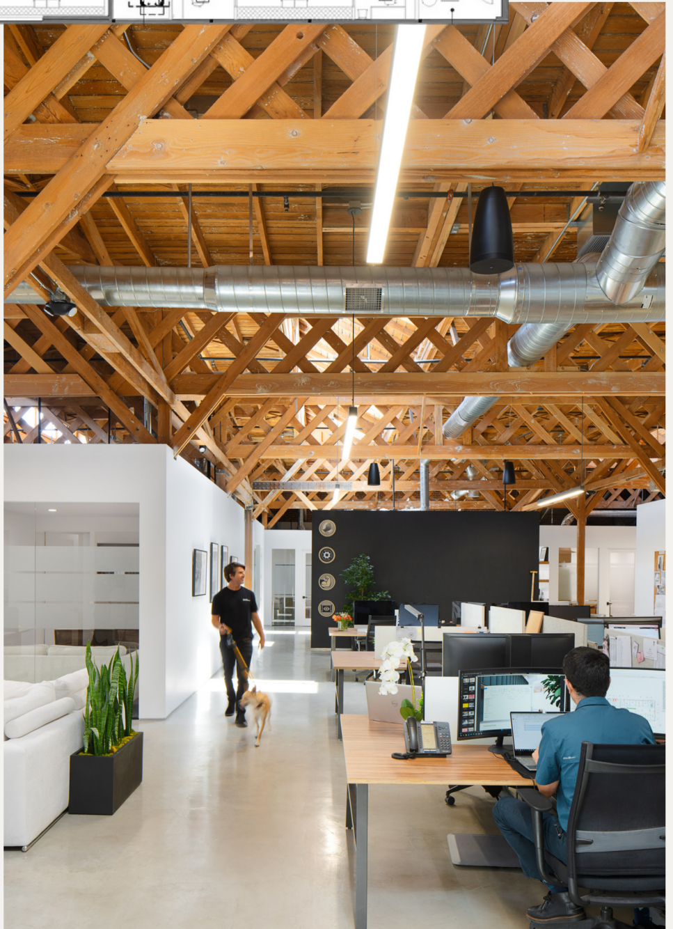
PASADENA OFFICE SPACE FOR LEASE