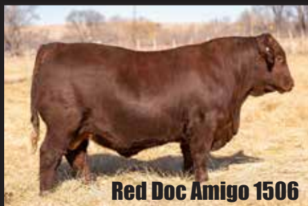
Red Doc Amigo 1506