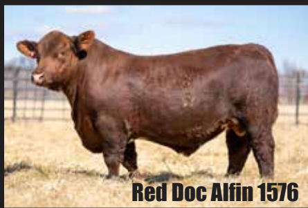
Red Doc Alfin 1576