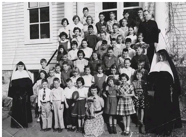
St. Joseph School