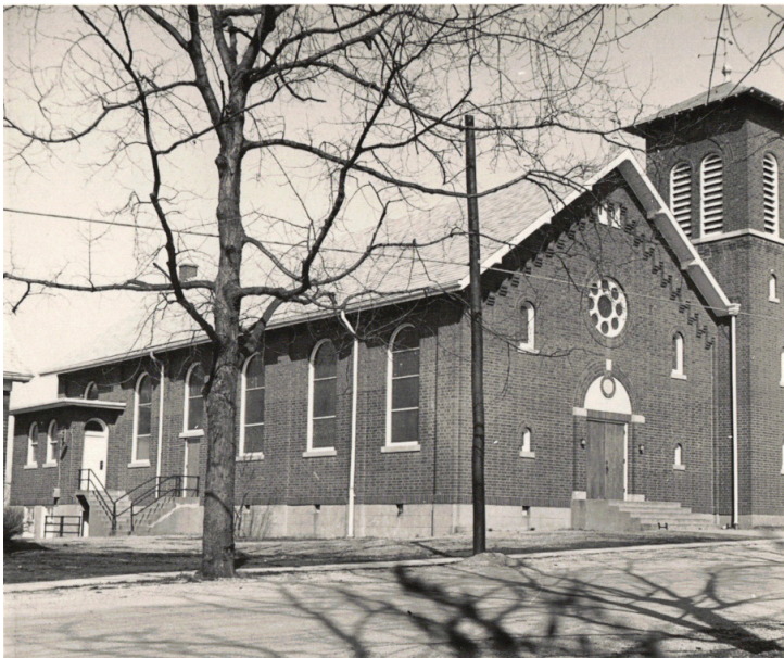
St. Joseph Catholic Church, Cobden