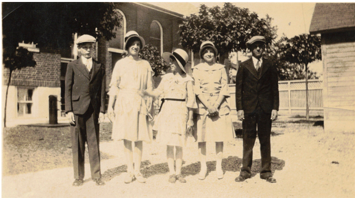
St. Joseph School Class of 1931