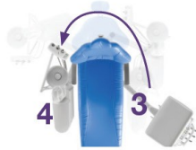
3-4. Swing cuspidor round to right side.