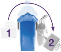
Incline chair. 1-2. Swing table round to left side.