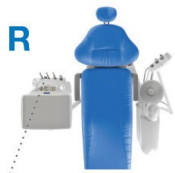
Right-handed set up. Raise chair height and remove the rear cover.

From left to right-side, or vice versa requires no tools or expertise. The simple procedure results in identical conditions for left and right handed operators.