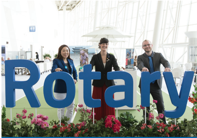
Attendees at 2016 Rotary International Convention, Korea