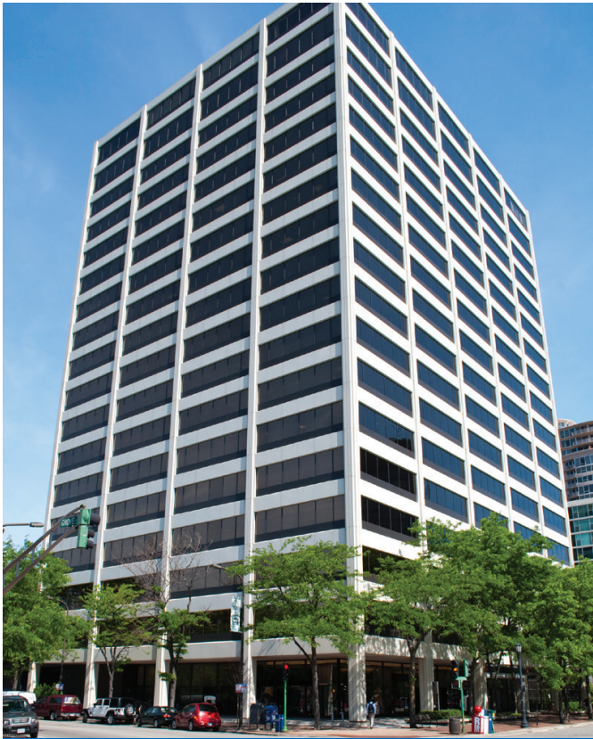
One Rotary Center in Evanston, Illinois, USA

Rotary International is administered by the Secretariat, which comprises the general secretary and nearly 800 employees who work to support clubs and districts around the world. Rotary's world headquarters is in Evanston, Illinois, USA, in a building called One Rotary Center. It includes a 190-seat auditorium, Rotary's archives, and an executive suite with conference rooms for the RI Board of Directors and Rotary Foundation Trustees and the offices of the