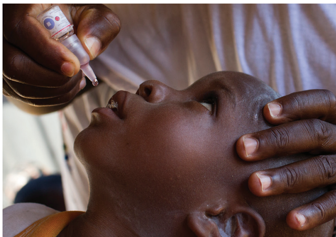
Rotarian administering polio vaccine in Nigeria, Africa

Our members’ and others’ contributions to the Foundation allow us to bring sustainable change to communities in need. Ask your club’s Rotary Foundation committee chair or visit rotary.org/donate to learn how you can support our Foundation. To learn more, download The Rotary Foundation Reference Guide or take the Rotary Foundation Basics course in Rotary’s Learning Center .